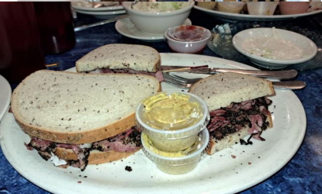
This was my take home