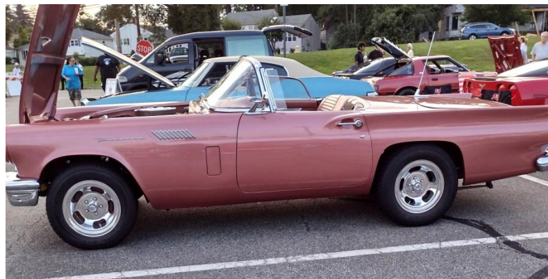
Gerry Ingersoll's 57