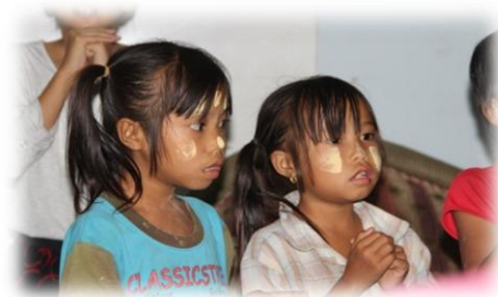
Thailand April 2014 Mission Trip Report