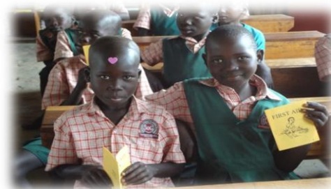
Uganda July 2014 Mission Trip Report