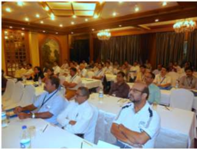
A section of the delegates for Failure Analysis training programme.

brought in by the participants and these were scientifically diagnosed by the faculty and the participants.