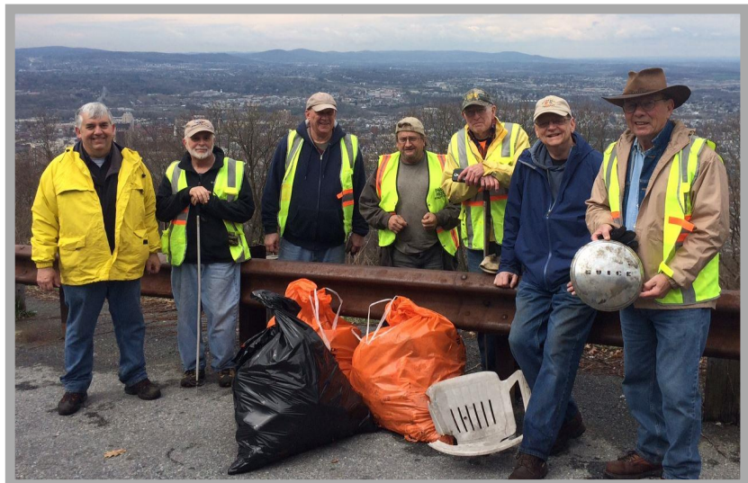
SDC cleanup crew on Duryea and Skyline drive