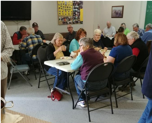
Some of our dedicated and much appreciated volunteers enjoying lunch!

National Volunteer Appreciation Week has just recently ended. The board of directors hosted a thank you BBQ lunch for our wonderful volunteers after each morning's work from April 17 th to April 21 st , a very small token of appreciation for a very committed and hard-working bunch. Our entire organization operates through volunteer efforts and we wouldn't be able to