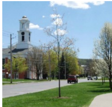
First Baptist Church of Hamilton, NY

27 Broad Street Post Office Box 73 Hamilton, New York 13346