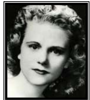
Viola Gregg Liuzzo