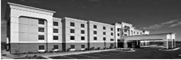
Hampton Inn & Suites of Jackson, Tennessee