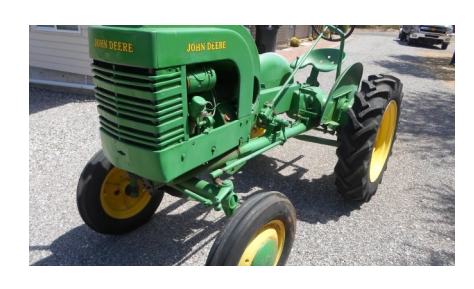
John Deere LA 1946