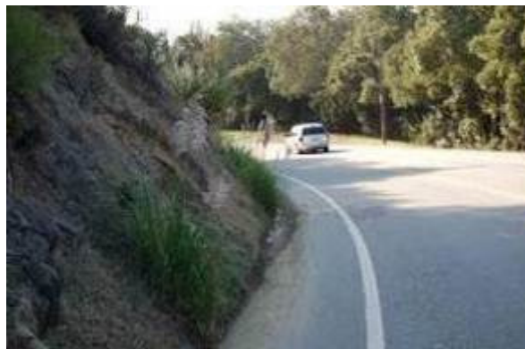
pampas grass on Sand Hill Road

A native pest of concern is poison oak ( Toxicodendron diversiloba ), which causes road user health problems, including lost work days and workers compensation claims. This weed encroaches into roadsides throughout the county.