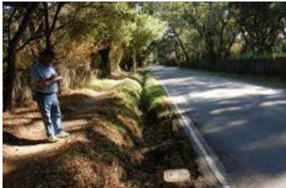
sprayed unpaved ditch - Kings Mountain Road

Paved drainage ditches were noted mainly on the Bayside, but where found on the Coastside had few problems from weeds. Unpaved ditches were problematic mainly on steep east-west roads leading up to and down from Skyline Blvd including Las Tunitas Road, where ditches were hidden and clogged with weeds. Soil erosion and blockage from debris and broadleaf weeds was noted in most unpaved ditches.