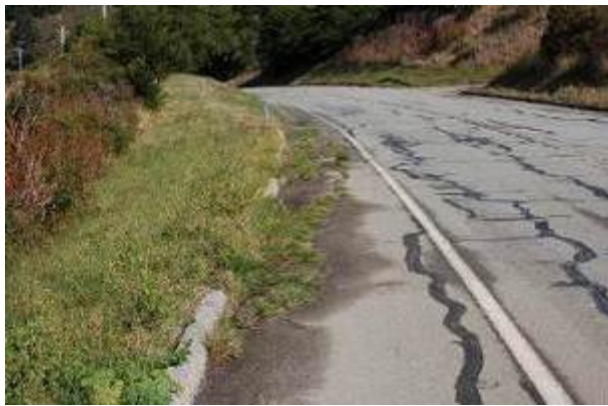
Cloverdale Road – No Spray Zone

Problems with vegetation encroaching into roadways include roadwidth shrinkage, increased pavement breakdown and reduced lines of sight. Bayside environmental factors that minimize weed encroachment include drier microclimates, higher levels of traffic and more paved surfaces. Coastside roads are wetter, have different traffic use patterns, and there are fewer paved surfaces.