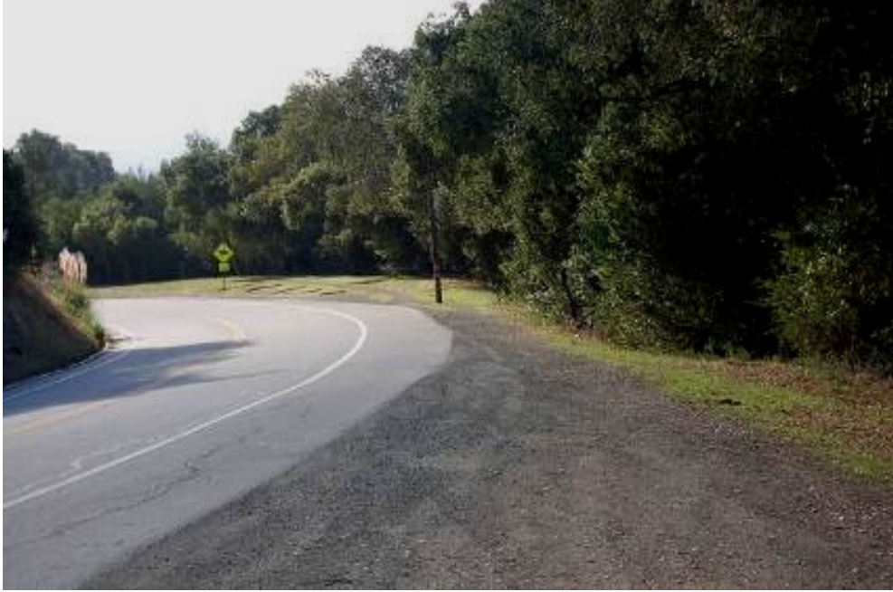
Sand Hill Road

San Mateo County maintained roads include many narrow winding roads used by cars, pedestrians, pets, bicycle riders, motorcycle riders and wildlife. Roads of this type are common on the Coastside, while in certain Bayside neighborhoods there are also narrow winding roads, but use is more restricted to cars and pedestrian traffic. By clearing from three to twenty feet of vegetation on both sides of the road, County staff maintains good lines-of-sight of the road and signage for all users.