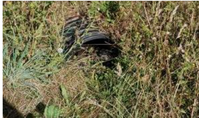
unpaved, unsprayed ditch Stage Road