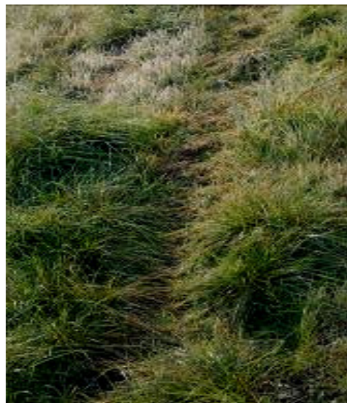
Mowed grass lined drainage Polhemus Rd.