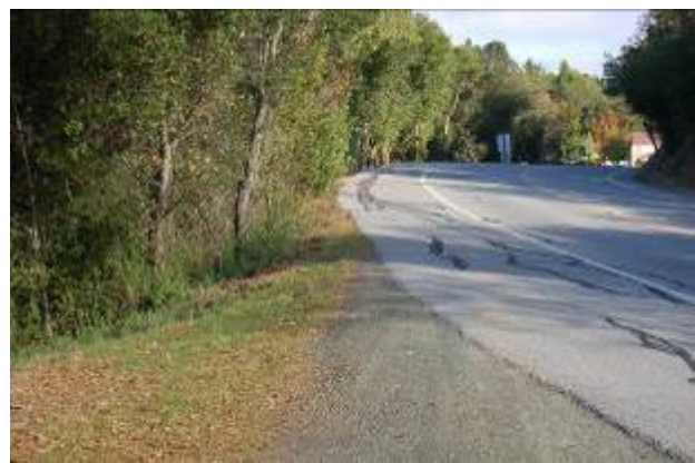
Sand Hill Road