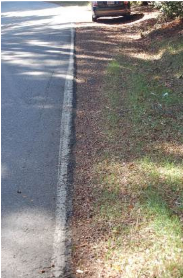
Apparent spray nozzle pattern in no-spray zone turnout