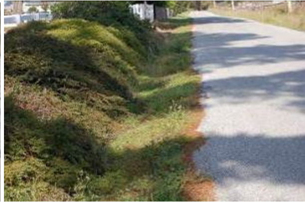
Stage Road – No Spray Zone, Opt-Out Site