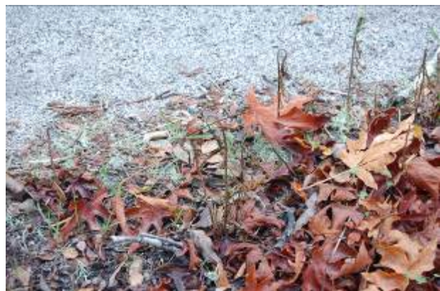
sprayed vegetation on bank above salmonid creek