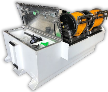
Lawn • Shrub & Tree Care Systems