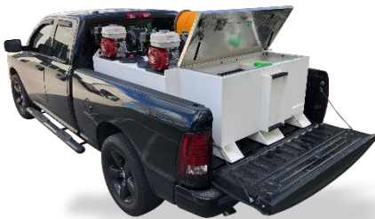
200 Gallon Fits 6.5' Bed w/Storage Box