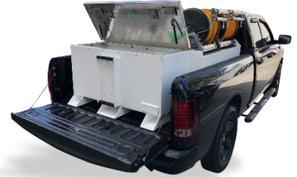
Safely Access Reels, Pumps & Tanks from the Ground