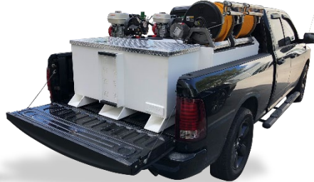
Low-Profile Compact Design