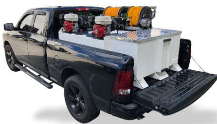
Professional Clean Appearance

Available Tank Configurations: 200 Gallon Unit • 200 Gallon Single Tank • 100/100 Dual Tank • 150/50 Dual Tank