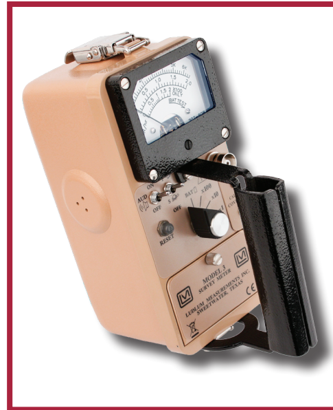
Part Number: 48-1605

Model 3000-Series of digital, low-weight, versatile instruments. See website for further details.