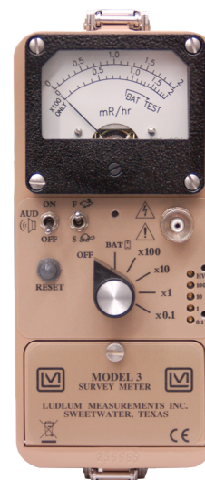
Model 3 face view