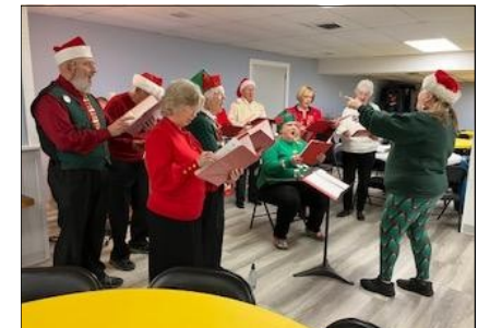
The singers performed after the December business meeting