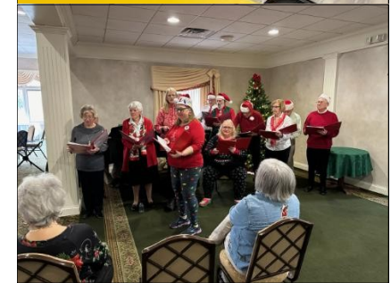
And... At Mound-builder's Country Club