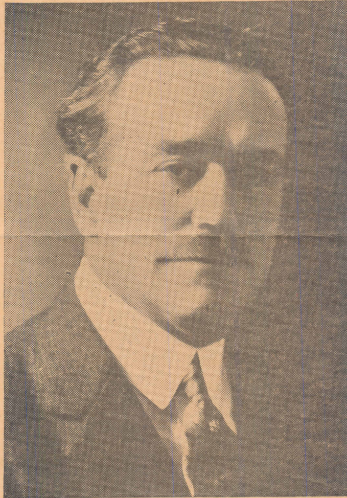
LATE CHARLES F. PARHAM

Founder of the Original Apostolic Faith, Full Gospel Movements