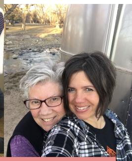
Needle Felting with Rocky Mountain Creative Quilters Ft. Collins, Colorado March, 2018