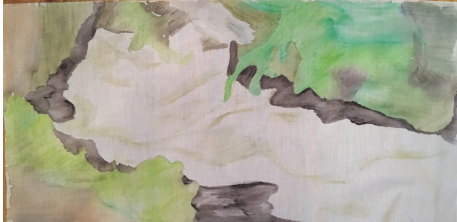
Sections blocked and colored with Inktense on muslin