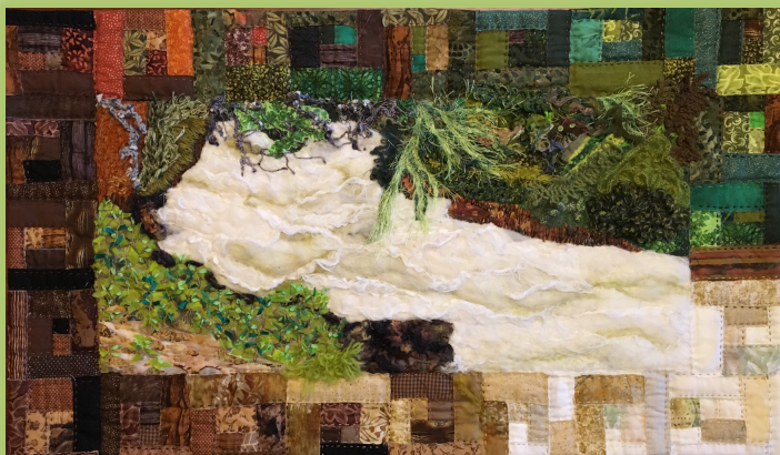
A Hidden River in Breckenridge 17"x29" Ann Myhre, 2018