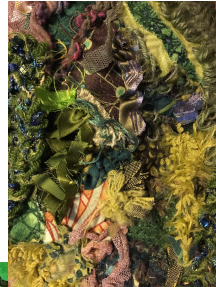
Close ups of the needle felted river and hand stitched scraps for greenery