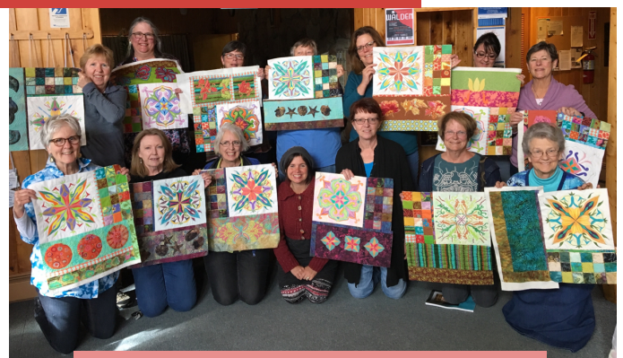
Quilt As Inspired with Monarch Quilt Guild Buena Vista, Colorado April, 2018