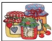
Exhibit Hall Department E Club and Commercial