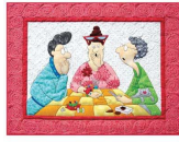
Exhibit Hall Department C Creative Arts (Continued)