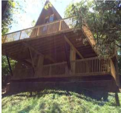
Lake House Personified! What a view!

SPRING IS JUST AROUND THE CORNER! GET READY!