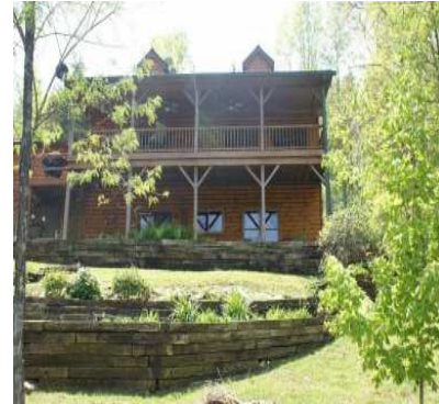
Custom Built, Vacation Year Round