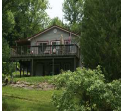
Exceptional Waterfront Many Extras