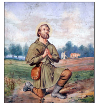
Feast Day: May 15