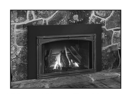
Direct Vent Gas Inserts