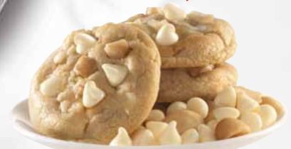
24 White Chocolate Macadamia Nut