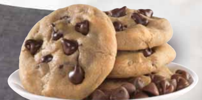
24 Chocolate Chip