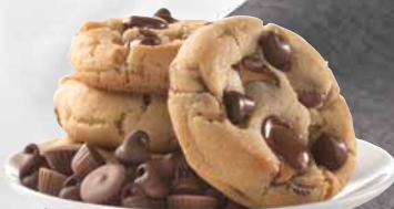
24 Peanut Butter Cup