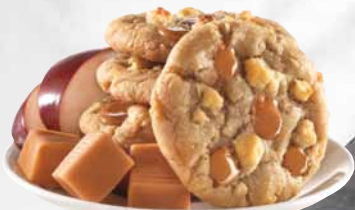
24 Caramel Apple