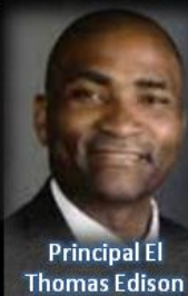
Principal El Thomas Edison