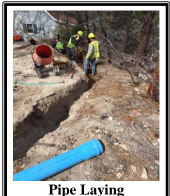
& Trench Filling

am to 4 pm and residents are asked to exercise caution in the work areas. Once completed, the new 6 inch line will be able to handle much more water flow for use in fighting a structure or brush fire and the addition of the two fire hydrants will allow firefighters to connect fire hose closer to the fire. The anticipated life of the new C900 PVC pipe is 75+ years. The next streets to undergo pipeline replacement will be connecting Badger and Porcupine to the main line on Deep Creek in the summer, and Truman in the fall. The full, tentative ten-year list of pipeline replacement projects is available at the District office.