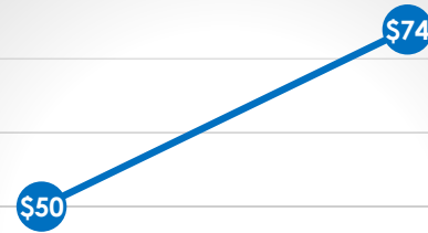
With SB-1 Gas Tax