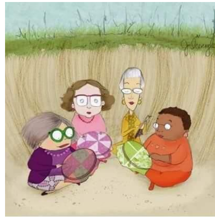
Stich in the Ditch Club

January – any solid color July – No Meeting February – any print August - neutral March – stripes September - brights April – polka dots October – floral May – animal or animal print November - patriotic June – Batik December – No Meeting