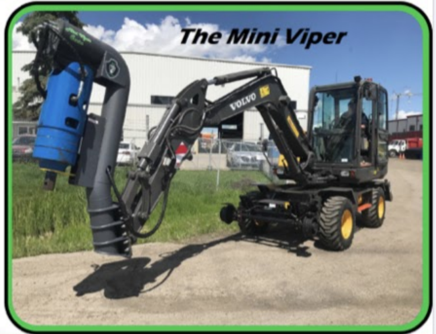
The Mini Viper