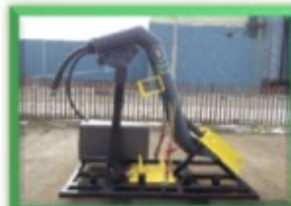
Custom transport skids