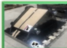
Custom hitching plates