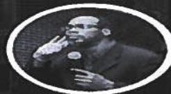
T ROY HIGH POINT, NC