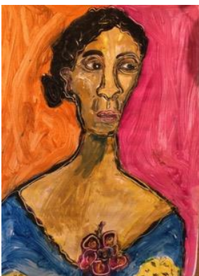
Doug Rice – “Danielle In Blue”

Participating artists in the October All-Members Exhibit include photographers, painters employing various media, sculptors, glass artists, woodworkers, weavers, fabric artists, furniture makers and more. From bright blue bubbles illuminating a dewy flower to hand-sculptured fairies that invoke magic, to expressive portraits, abstract and impressionistic seascapes, and evocative watercolors, a wide spectrum of art will be on view. Examples below. Shows at the ACGOW Gallery change monthly and visitors are encouraged to stop by the Gallery every First Friday for our monthly opening reception. The Gallery also features a shop stocked with small affordable works and objects d’art as well as prints and greeting cards. The Gallery’s new location at the Westerly Train Station is open Wednesday through Saturday, 11 – 7 p.m. and Sunday, 1 – 5 p.m. Please call 401-596-2221 with any questions, and/or visit www.westerlyarts.com or the ACGOW Facebook page for information about ACGOW shows and artists.