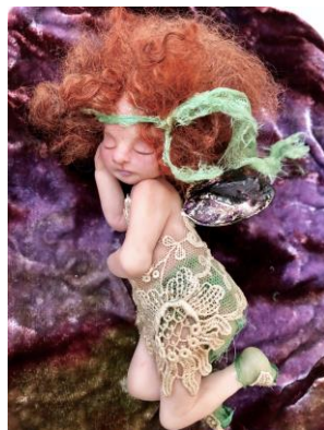
Madeline Beaudry – “Peaceful Slumber”