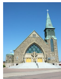
Saint Augustine's 340 Dominion Street Moncton, NB