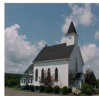
Saint Lawrence O'Toole 2340 Route 115 Irishtown, NB