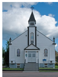
Our Lady of Mercy 11 St. Andrews Street Pointe-du-Chêne, NB