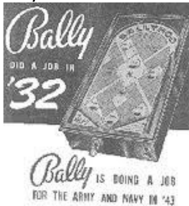
Promotional 1932 Bally Ad.

Three very rare miniature antique pinball machines dating from the 1930's are on display. Pinball machines provided great entertainment during the 1930's as they do today.