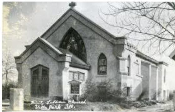
This is a photo of the former Trinity Lutheran Church that was located at 305 S. Ardmore Avenue. In 1950's, this property was purchased and became the Villa Park Public Library when Trinity Lutheran built its new church across the street. This building was demolished after the new library was built.