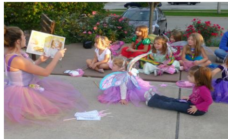
Park & Recreation program.