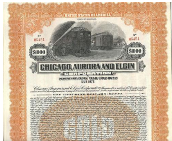
Chicago Aurora & Elgin Stock Certificate.