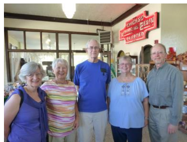
Willowbrook class reunion members.