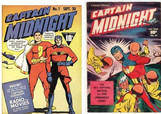
Captain Midnight comic books.