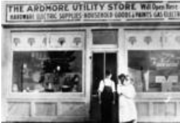
The Ardmore Utility Store c 1914 was an early business in town.