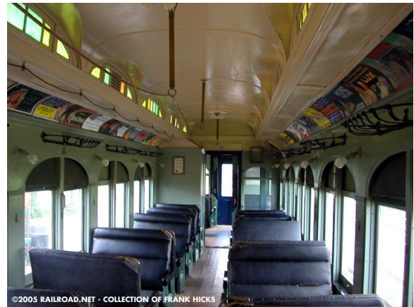
Interior of the CAE car 308.

On July 3 rd , 1957 the Chicago Aurora and Elgin Railroad ceased to exist. Riders had to find their own transportation back home that evening.