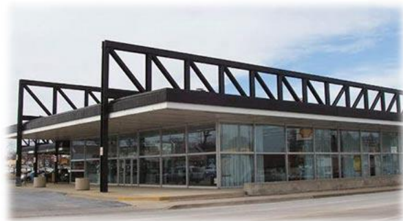
This is a photo of the former Villa Park Trust and Savings Bank (VPTS) built in 1922 at 207 S. Villa Avenue. In 1964, VPTS erected a new modern building at 10 S. Villa Avenue used a Mies van der Rohe design. BMO Harris Bank now occupies this property.