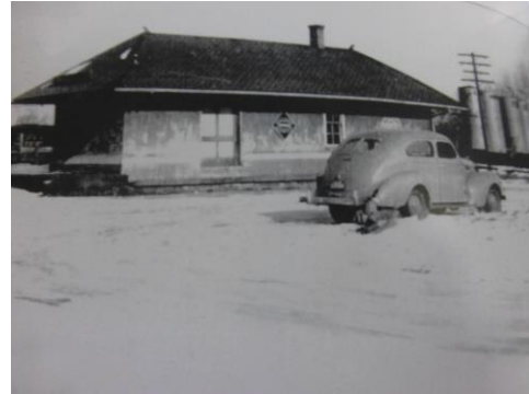
The Chicago Great Western Railroad depot in 1933.