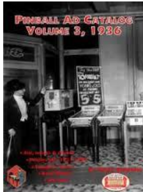
Pinball Ad Catalog from 1936.