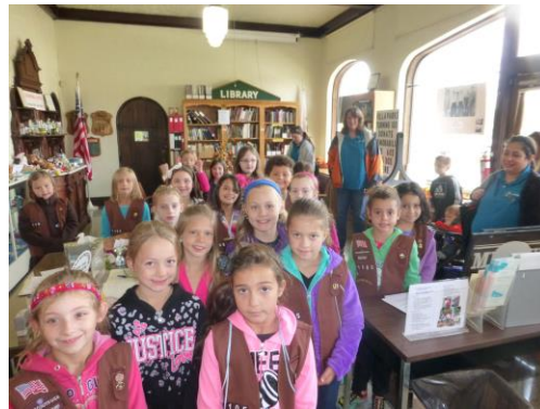
Girl Scouts Visit the Museum.