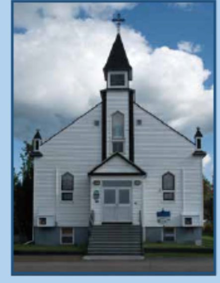
Our Lady of Mercy Pointe-du-Chêne

Parish Office: 340 Dominion Street, Moncton, NB E1C 6H8 Phone: 857-4223 Fax: 857-0020 Email: parish.office@qasmoncton.com