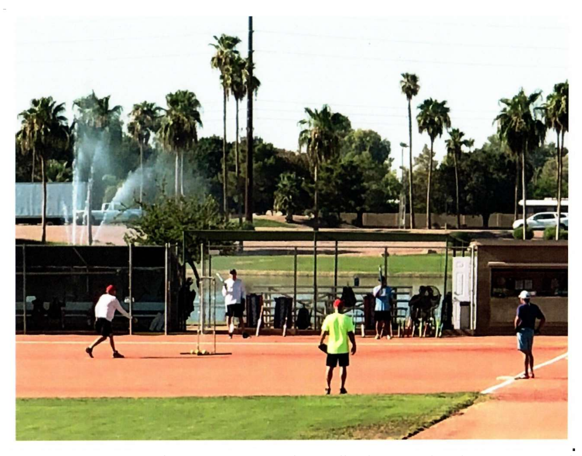
Ronnie Pennington pitching in a recent physically-distanced pick-up game at the Field of Dreams