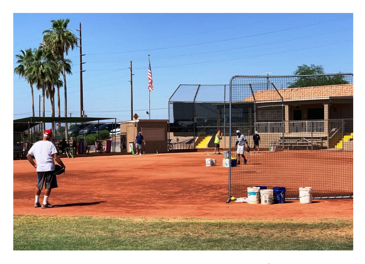
Socially-distance batting practice at the Field of Dreams

As of press time, the resumption of our program, including our summer session, was still uncertain. Check our website, <a href="www.sunlakessoftball.com">www.sunlakessoftball.com</a>, for up-to-date information.