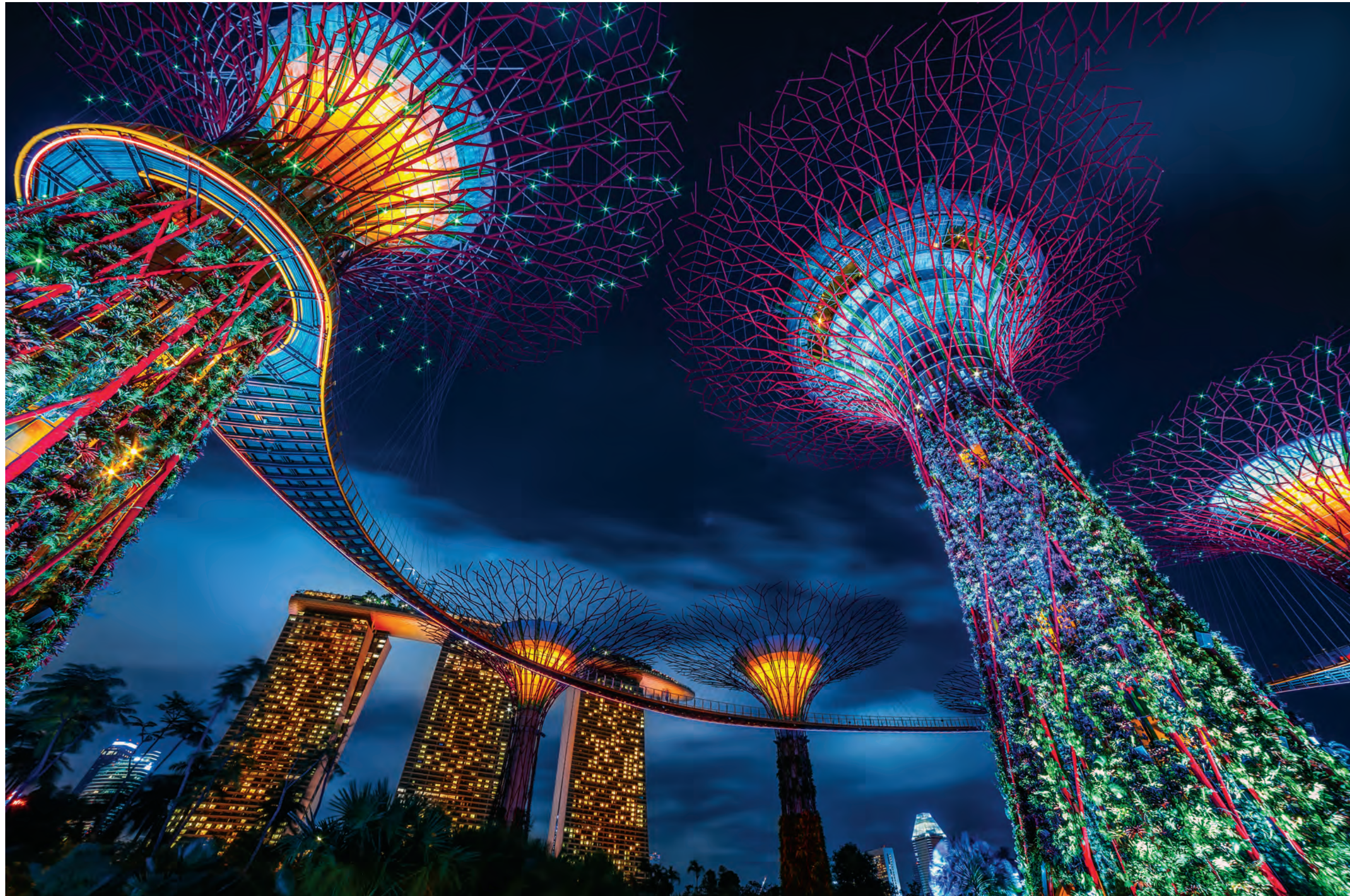
LEFT: SINGAPORE | At night the vertical electric gardens of the supertree grove at the botanical park Gardens by the Bay come alive with light and sound.