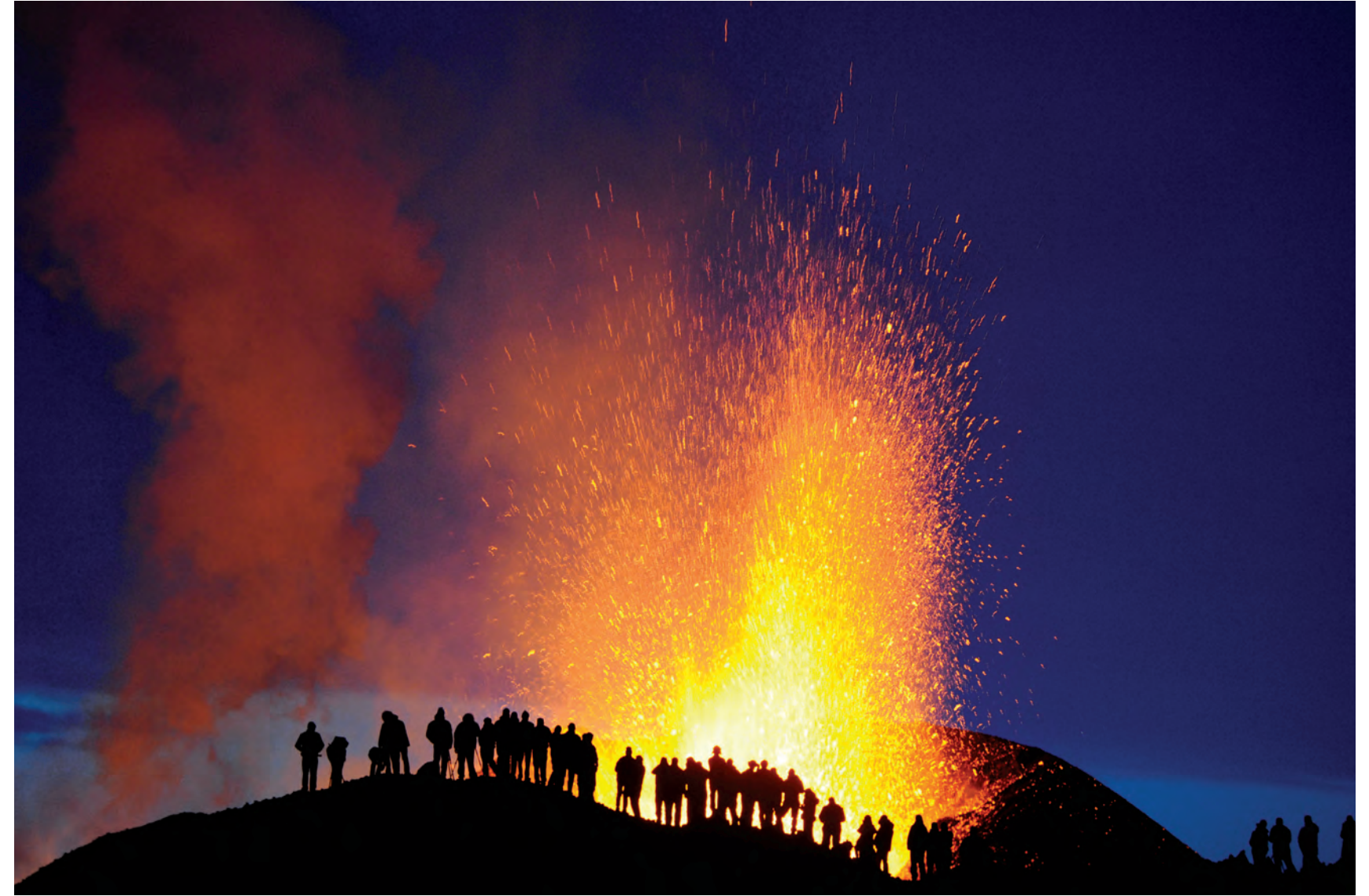
EYJAFJALLAJÖKULL, ICELAND | Tourists watch lava erupt from Eyjafjallajökull volcano.