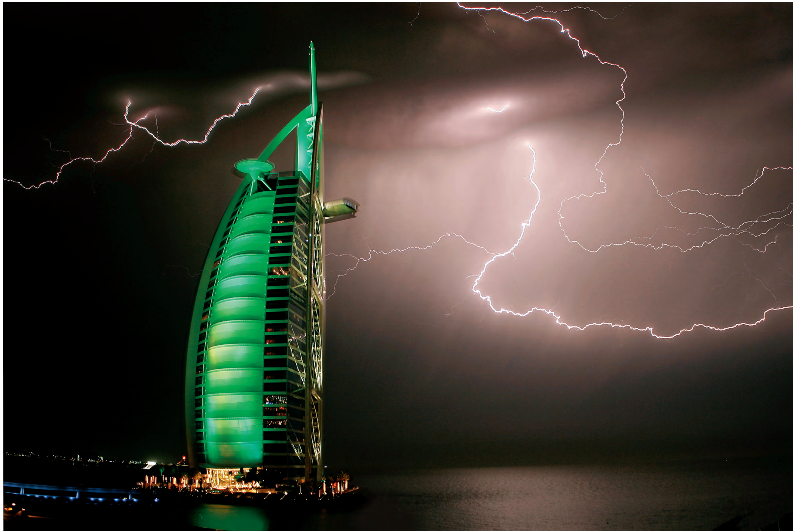
DUBAI, UNITED ARAB EMIRATES | The Burj Al Arab Jumeirah hotel appears like a sail in the middle of a lightning storm. | Maxim Shatrov