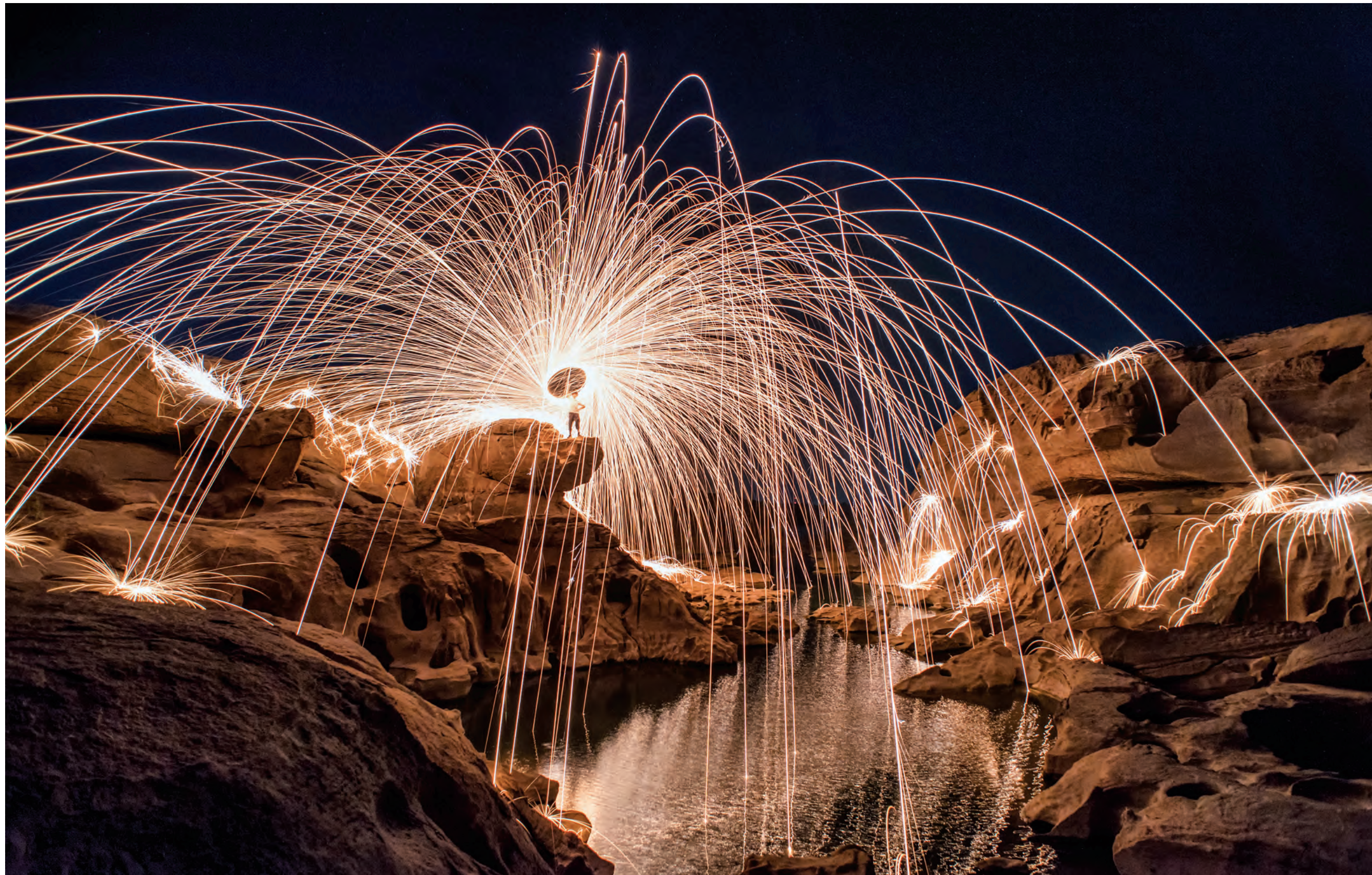
LEFT: UBON RATCHATHANI PROVINCE, THAILAND | Fire and spinning steel wool create a fountain of light in a rock canyon. | Korawee Ratchapakdee