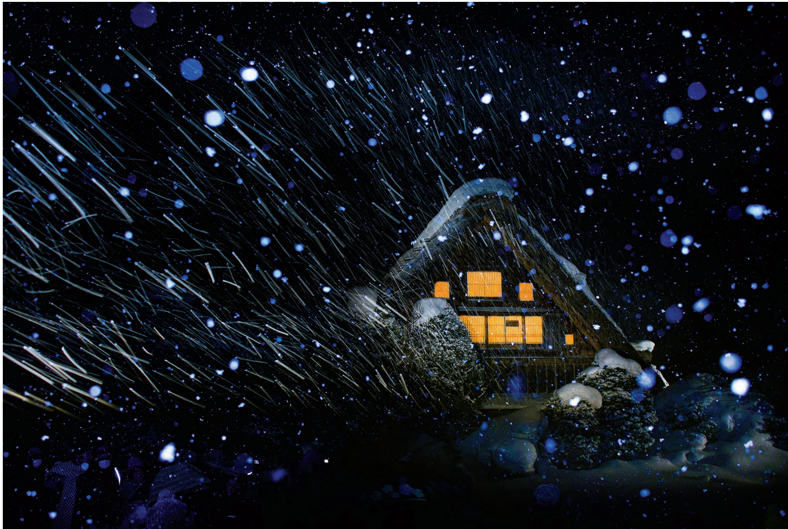
RIGHT: SHIRAKAWA-GO VILLAGE, JAPAN | Snowflakes fall in front of a thatched-roof house in an isolated village in Central Japan. | Masaru Yamauchi