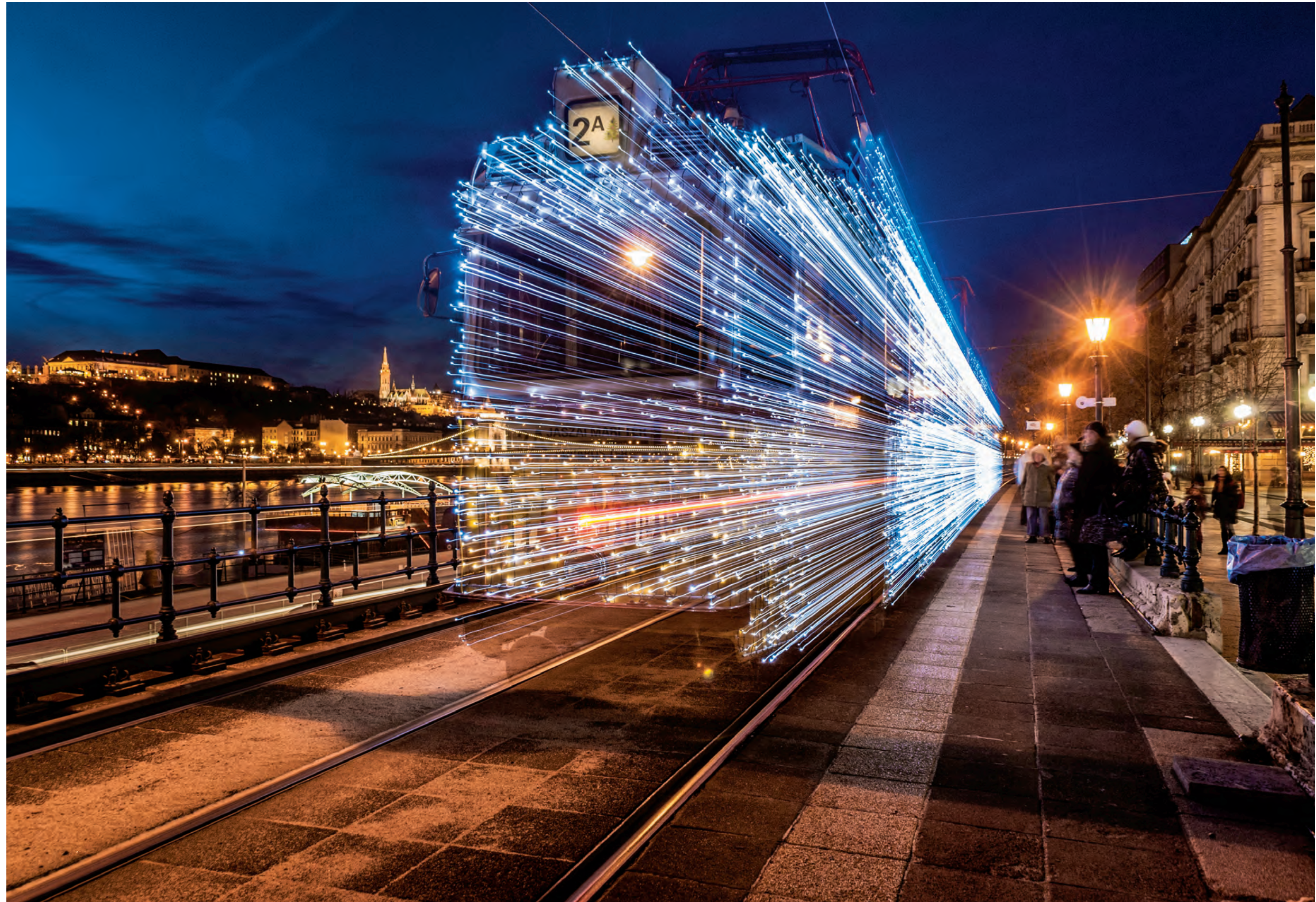
BUDAPEST, HUNGARY | More than 30,000 blinking LEDs light a city tram to create a festive atmosphere during the cold winter season. | Viktor Varga