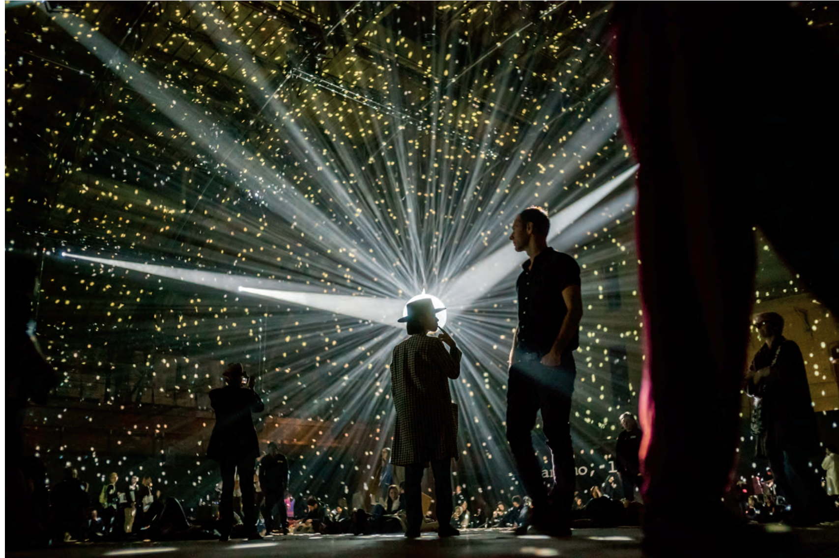
NEW YORK, NEW YORK | A crowd enjoys Laurie Anderson's installation, "Habeas Corpus"—the story of a prisoner at Guantánamo Bay.