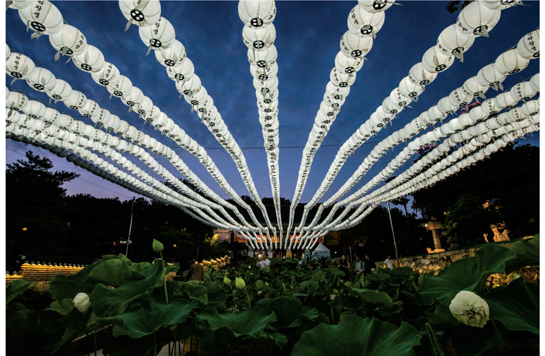
SEOUL, SOUTH KOREA | Hundreds of bright lanterns fan out overhead at Bongeunsa, a Buddhist temple.