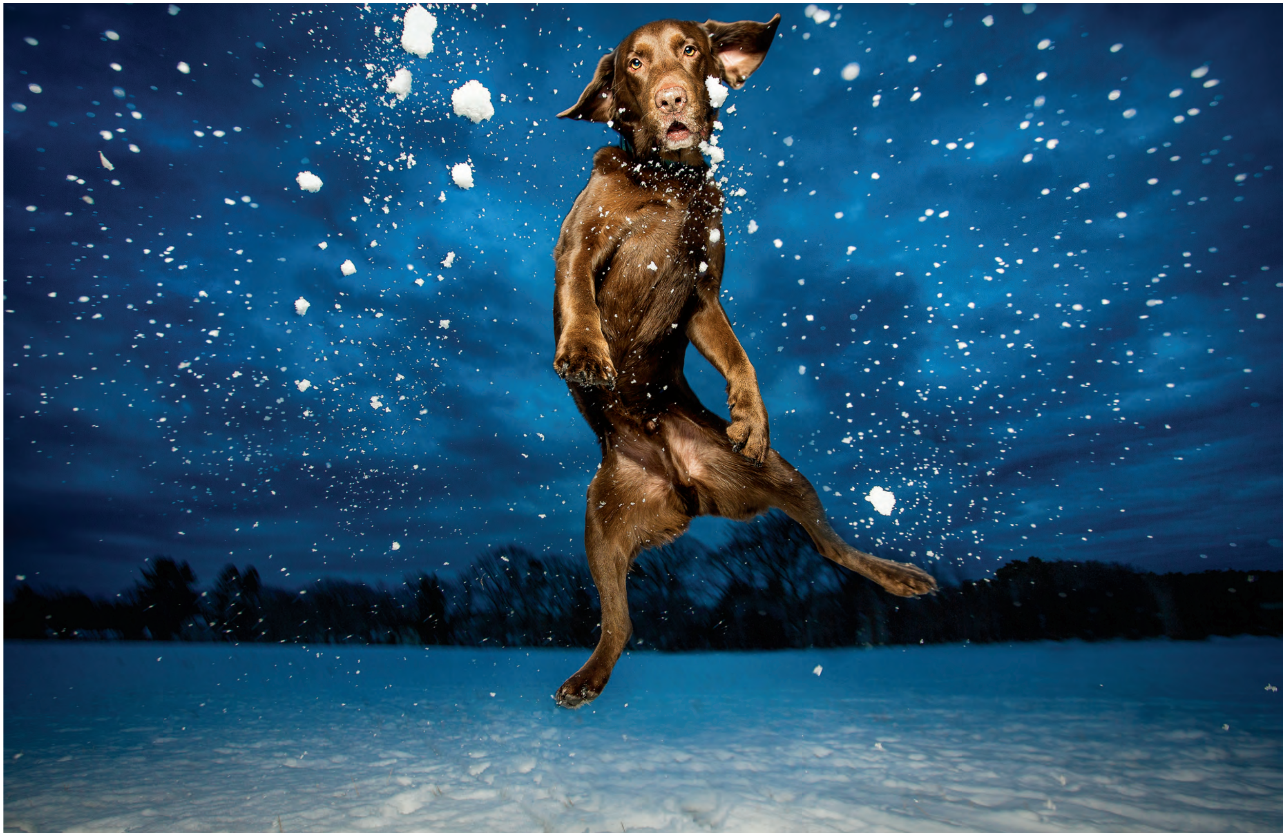
RIGHT: NEWBURYPORT, MASSACHUSETTS | Guinness, a chocolate Lab, takes to the air in a snowy field.