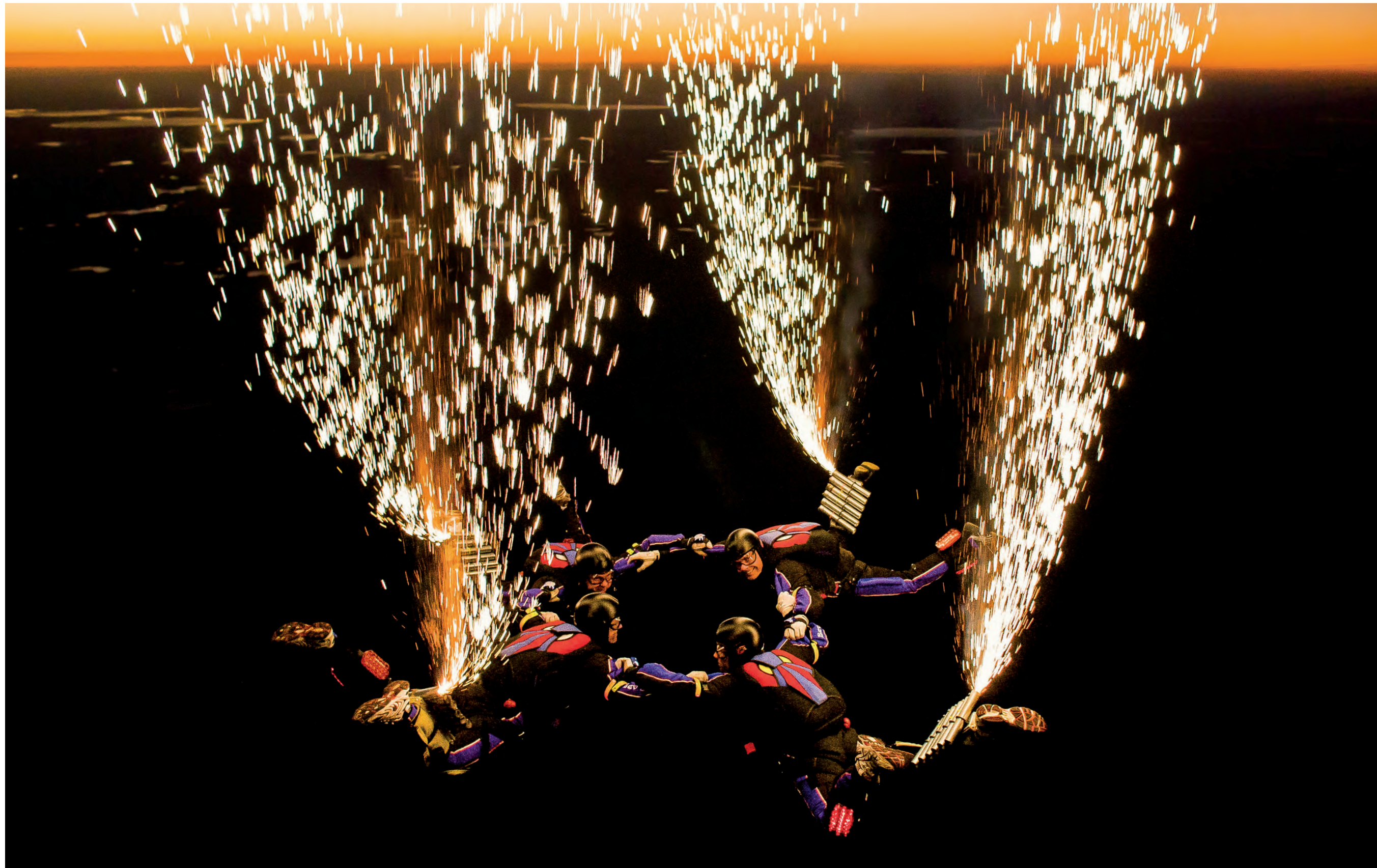
PALATKA, FLORIDA | Team Fastrax skydivers make their jump more extreme by lighting off fireworks and joining hands in the night sky.