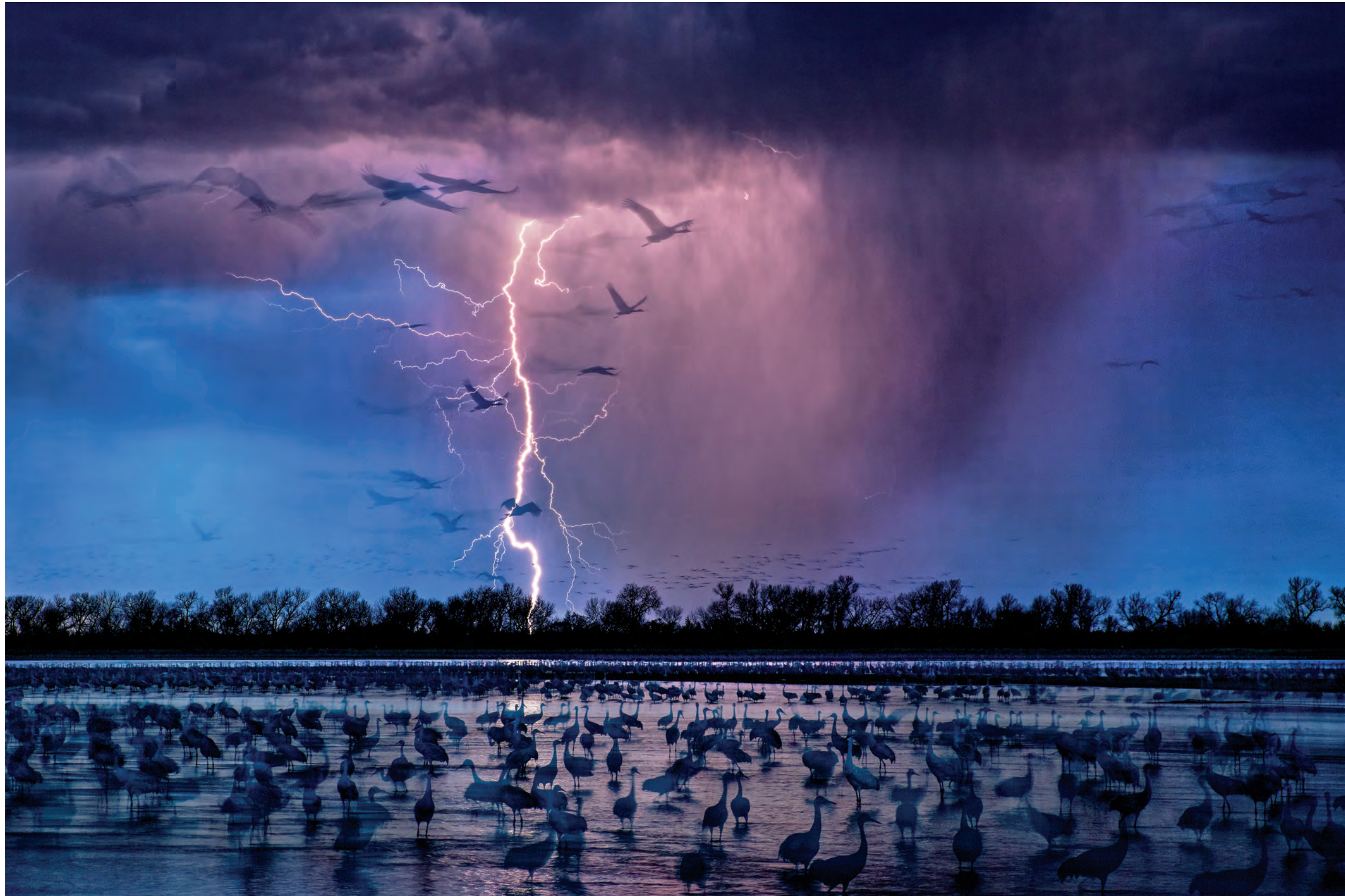
PLATTE RIVER, NEBRASKA | Thousands of sandhill cranes congregate on the Platte River during their annual spring migration. | Randy Olson