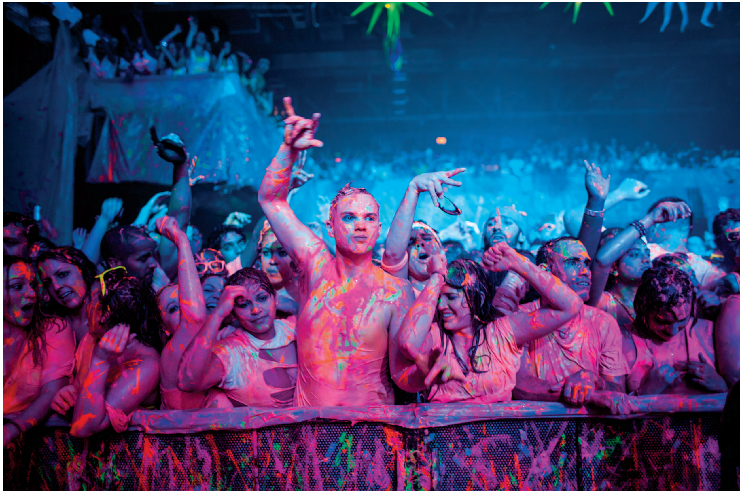
LEFT: AUSTIN, TEXAS | Teenagers dance while doused in neon paints at the Dayglow Music Festival.