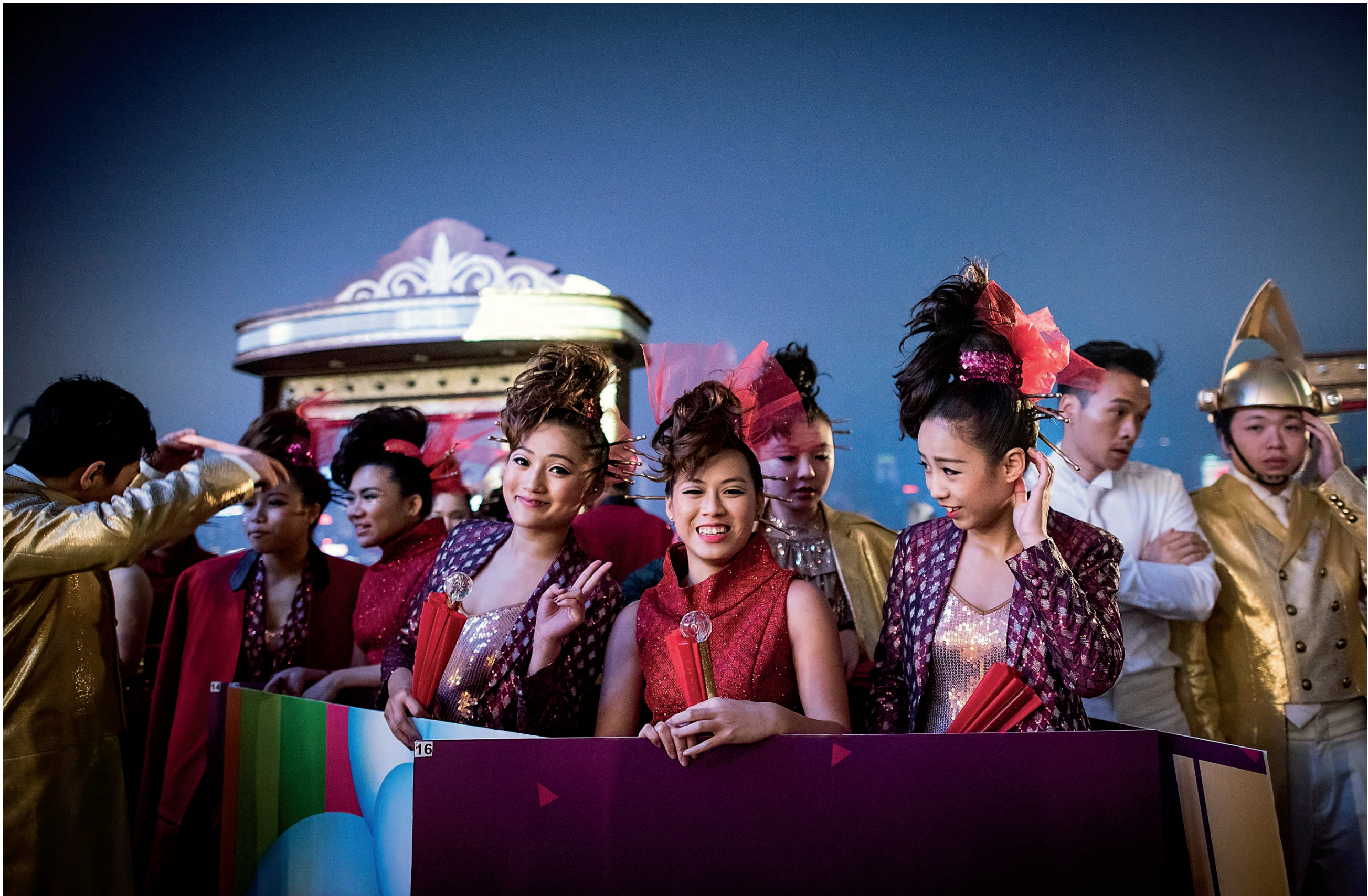
RIGHT: HONG KONG | Performers wait to begin the Cathay Pacific International Chinese New Year Night Parade.