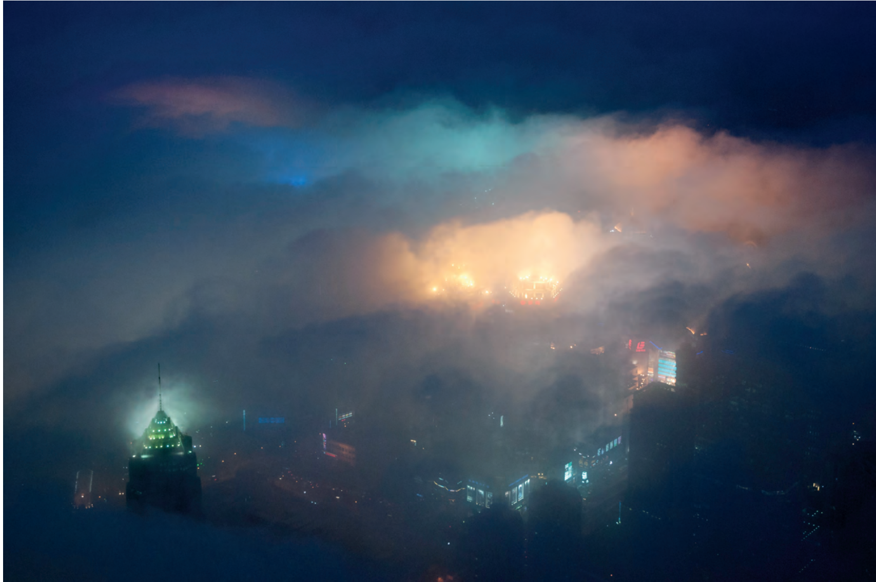
SHANGHAI, CHINA | The lights of the city peek through low-level clouds.