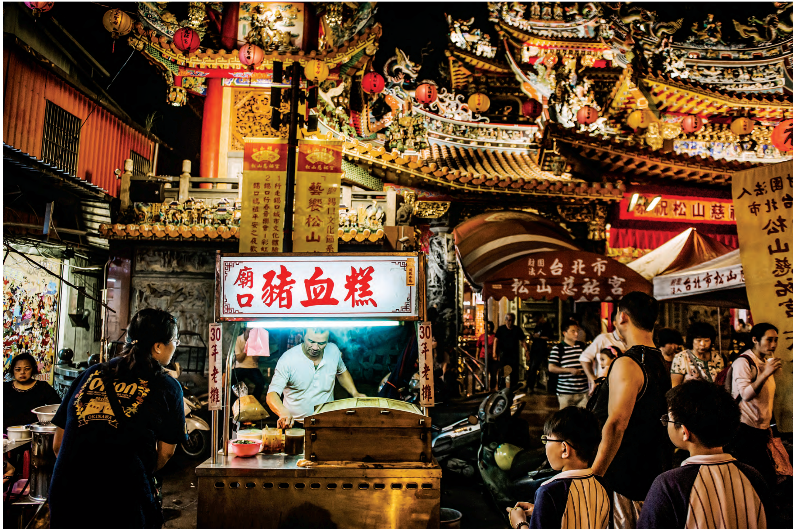
LEFT: TAIPEI, TAIWAN, CHINA | The streets fill with hungry people during the Raohe Street Night Market. | Dina Litovsky