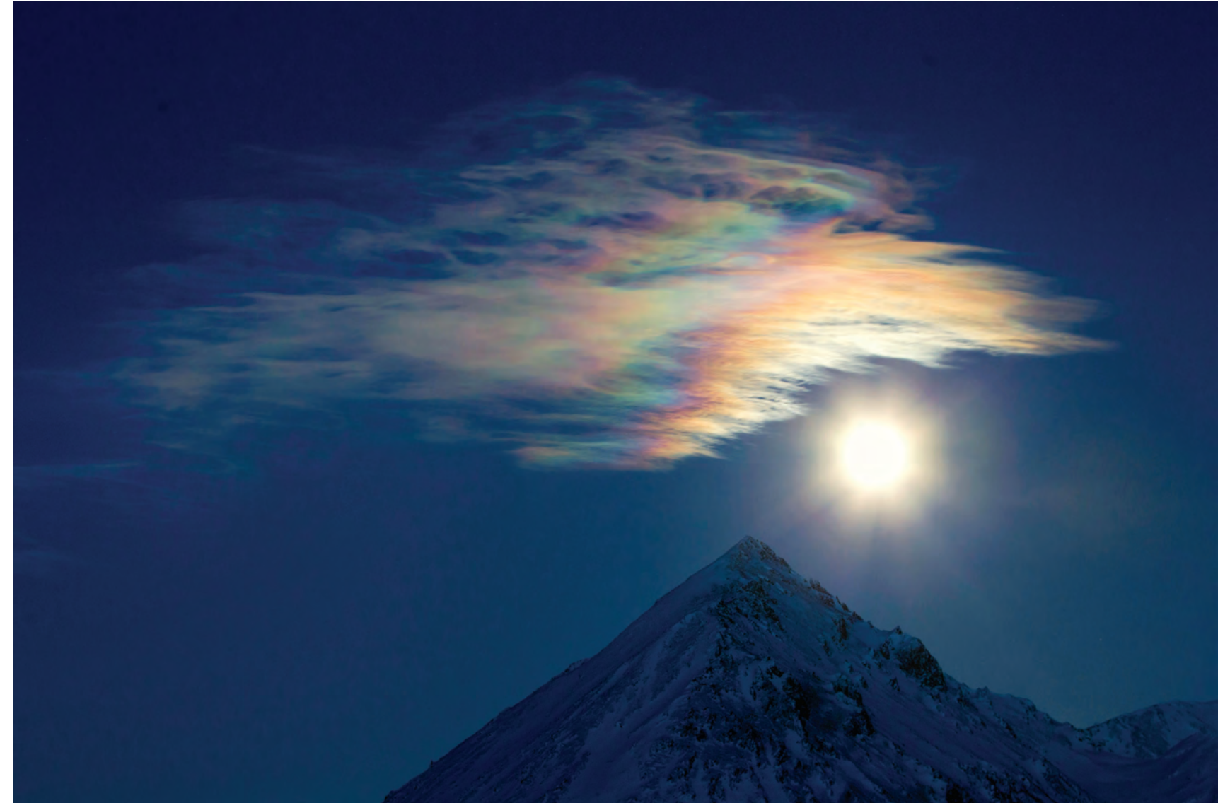
YUKON TERRITORY, CANADA | A full moon and rainbow clouds hang above the Ogilvie Mountains.