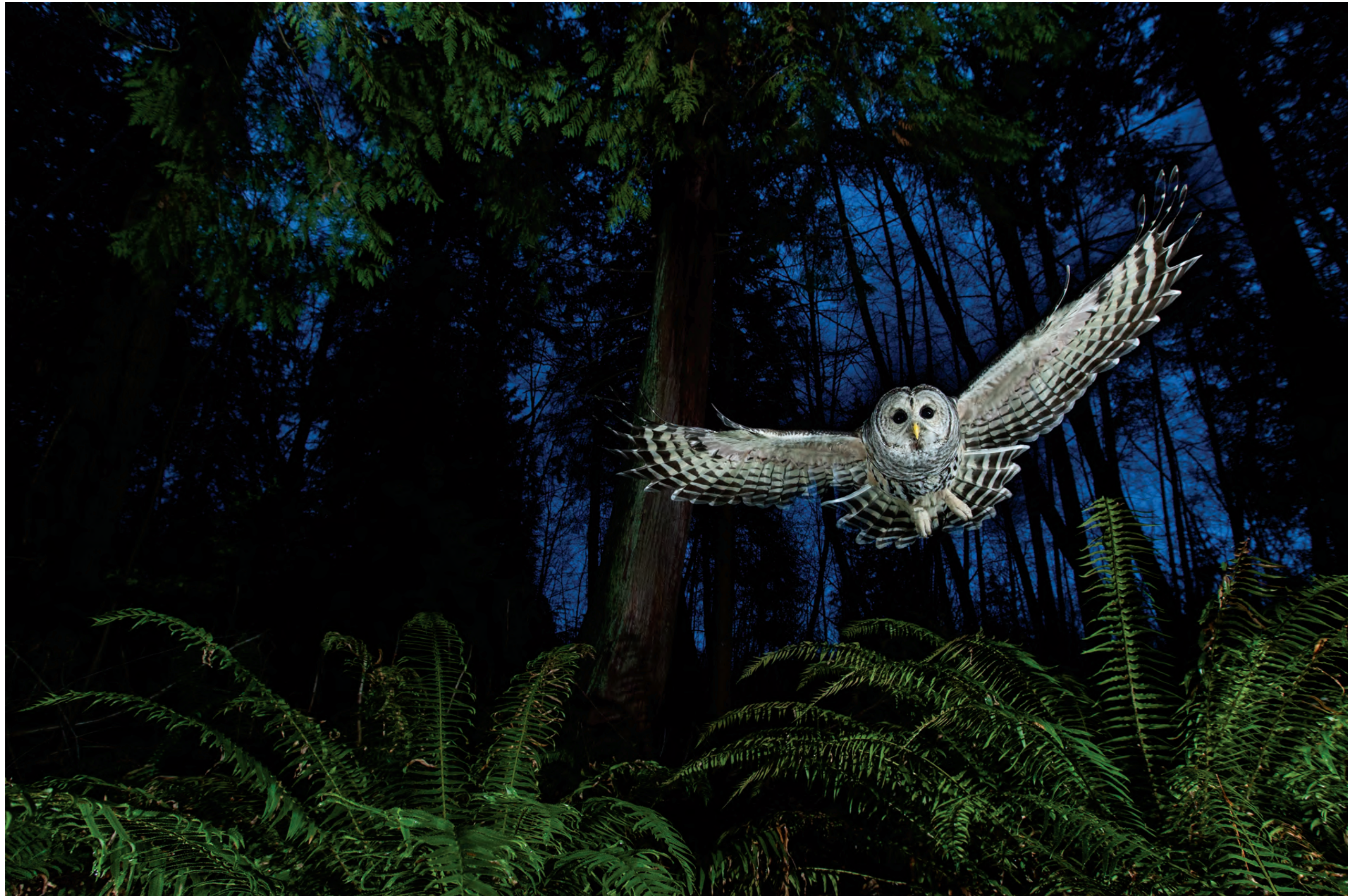
BURNABY, BRITISH COLUMBIA, CANADA | Looking for prey, a female barred owl swoops through a forest. | Connor Stefanison