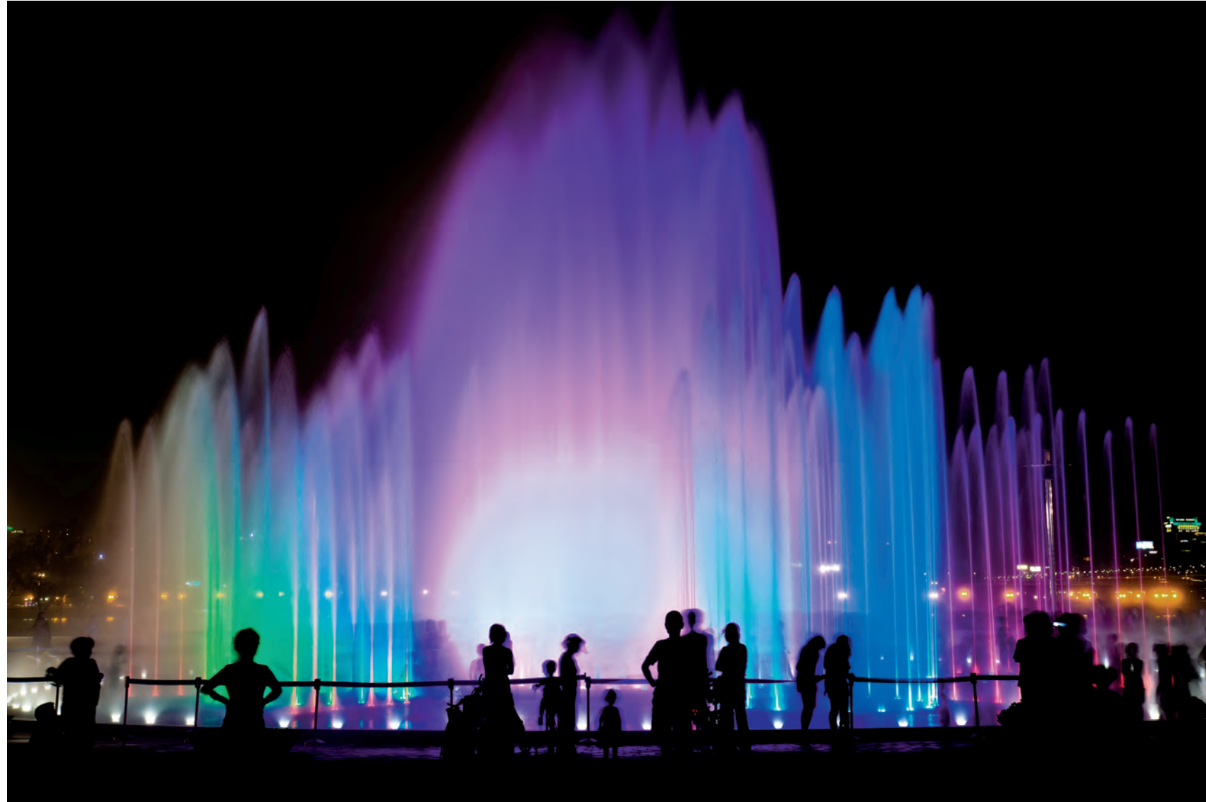
SEOUL, SOUTH KOREA | A fountain comes alive with color in Ttukseom Hangang Park.