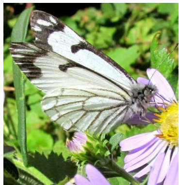
Pine White Butterfly