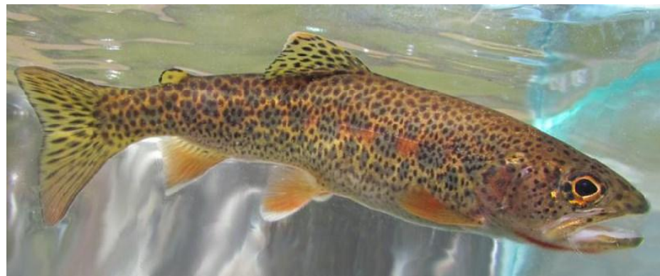
Coastal Cutthroat Trout