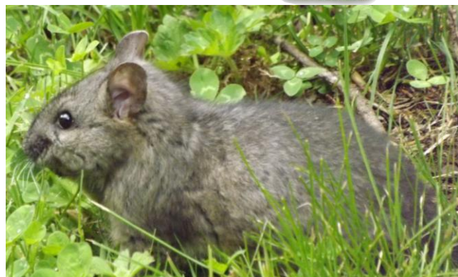
Bushytail Woodrat or "Packrat" (rat-sized)