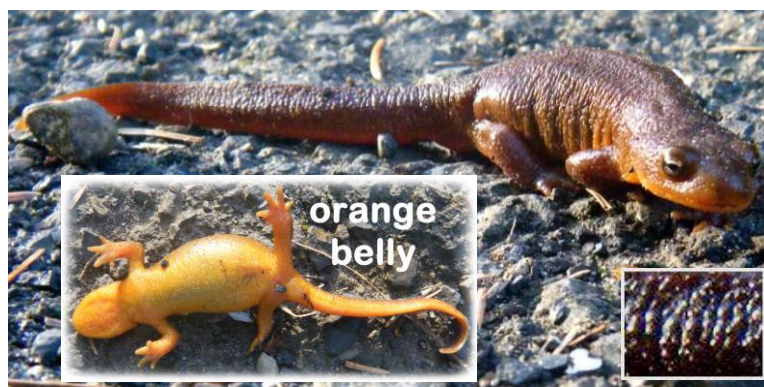
Rough-skinned Newt (poisonous skin, no scales)