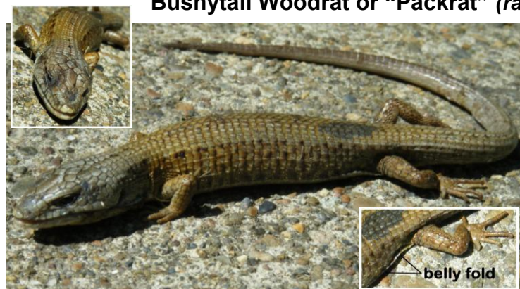
Northern Alligator Lizard (scaly)