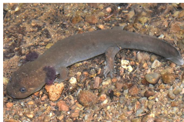
Coastal Giant Salamander