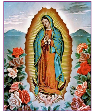
Feast Day: December 12