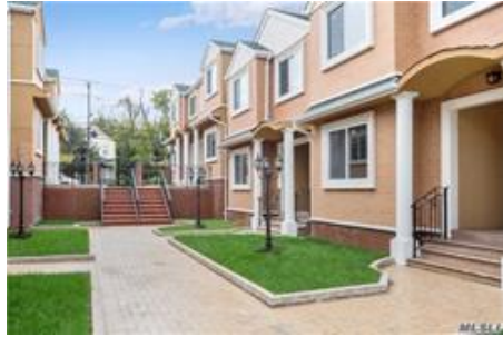
Townhouse @ Great Neck