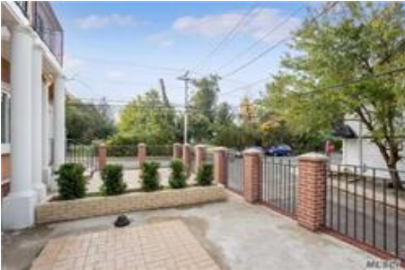
Townhouse @ Great Neck