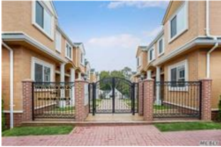
Townhouse @ Great Neck