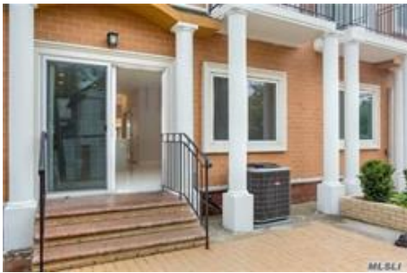
Townhouse @ Great Neck