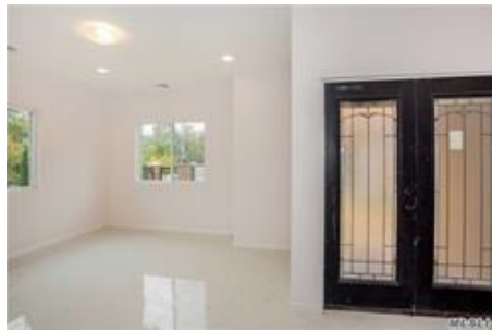
Grand Entrance Foyer