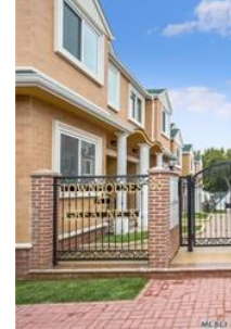
Townhouse @ Great Neck