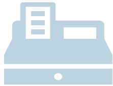
Assistance to Businesses