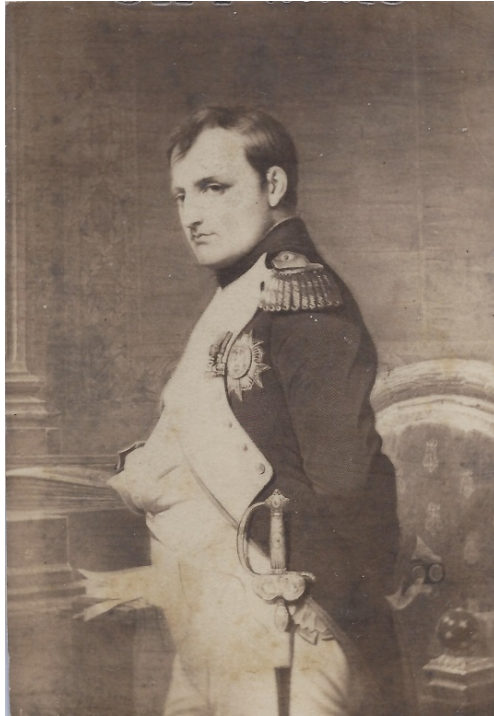
Napoleon Bonaparte (1769-1821)

The proletariat Reign of Terror in France, now at war with most of its neighbors, plays itself out roughly five years after it begins.