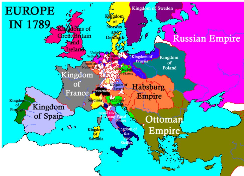
Map of Europe As The French Revolution Begins

From the moment George Washington begins his presidency, global events are about to be dictated by the revolution under way in France.