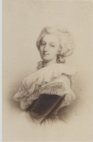
Queen Marie Antoinette (1755-1793)

Having just killed their King and Queen, the French decide to immortalize both through the ancient practice of creating death masks. This involves molding a wet plaster cast over the head of the deceased, allowing it to dry, and then removing and reassembling the front and back into a lifelike representation. The famed “golden death mask” of the 18 year old King Tutankhamen dates the art as far back as the Egyptians.