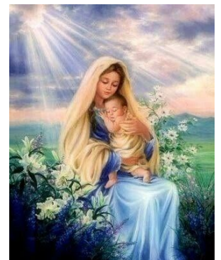
Feast Day: September 8