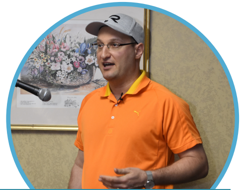
GOLF FUN FUNDRAISING!