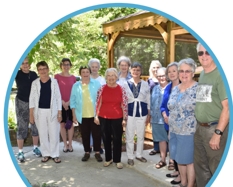
SHARING FOOD & STORIES!

Monthly programs include dutch treat lunches at local restaurants and coffee hours. Educational and entertaining programs such as “Marrying into a Southern Family” and “Lobstering in Maine”, and social events such as a luncheon and book reading at a member's country home were provided through out the year.