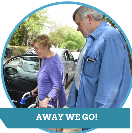
AWAY WE GO!

"I really appreciate everything that has been done for me because it has kept me in my condo." ~ FriendShip Participant in Forest Acres