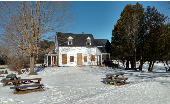
Find this beautiful farm house in the middle of the park.