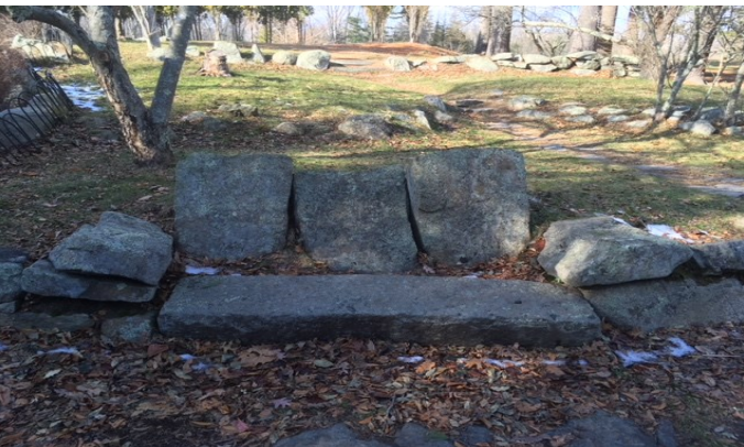
Imagine taking a break on this rock bench after a hard day working in the garden.