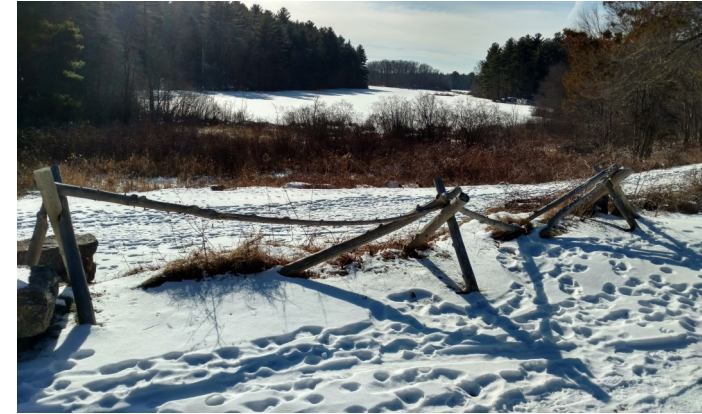
This is a nice Upper "Upper" view point!