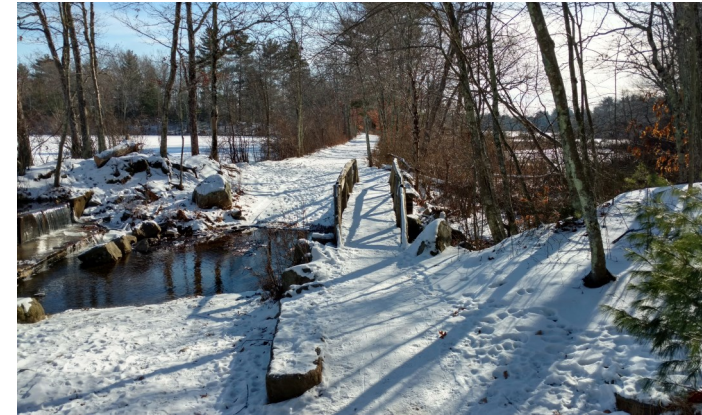
This cedar bridge overlooking a little waterfall.