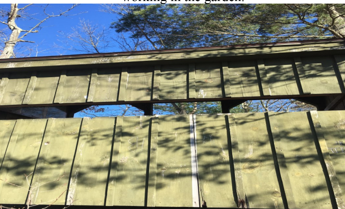
This is a great spot to watch some birds.