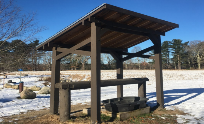
Every farm needs a place to tie up a horse.