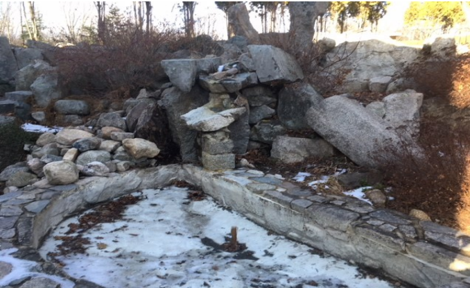
In the winter, there is no water flowing in this fountain.