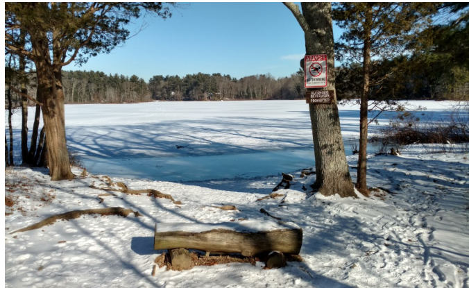
A great half way point along the Pond Walk Loop.