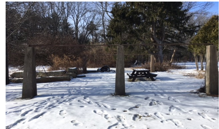
A nice place to relax if you were the Amesess chauffer.