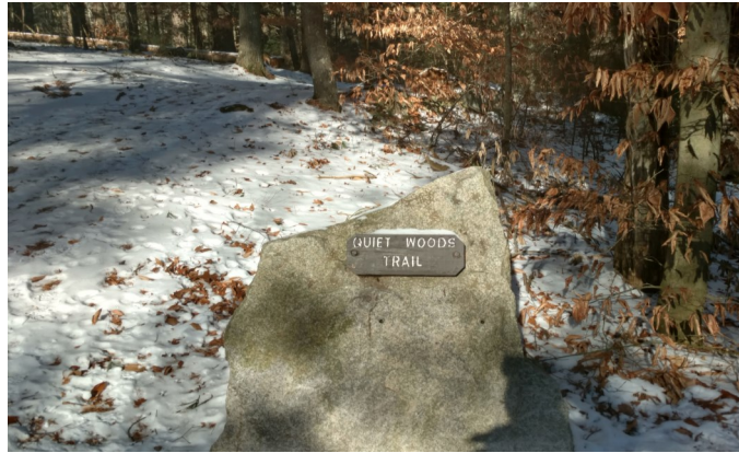
Shhhhhhh! No talking allowed on this trail.