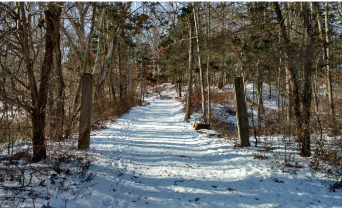
Notice the two old cement gate posts. A house must have been close by.