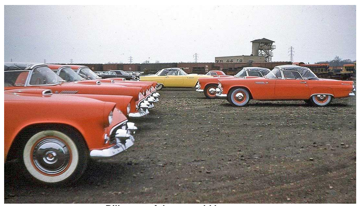
Bill - one of these could be yours