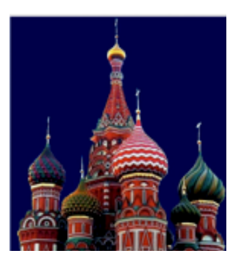
Genres: Drama - Geopolitical Thriller - Action - Spirituality - Artistry

Sequel to "America 2.0: Artistry" & Prequel to "Mastermind", "Resurrection" & "Cataclysm"