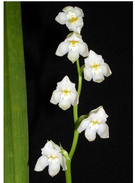
Encyclia cochleata above left Cuitlauzina (Osmoglossum) egertonii above right