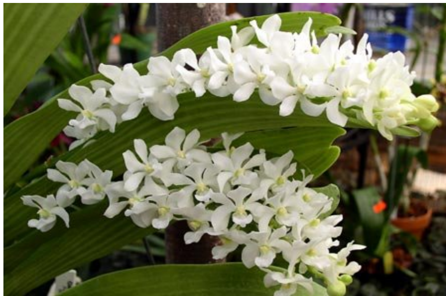
Rhynchostylis gigantea alba

Vandopsis parishii v. Mariottiana pot size 2 1/4", leaf span 2-2 1/2" $4.00 - fragrant beauty. Much nicer color variety than the standard parishii. This plant is NOT a hybrid between a Vanda and a Phal. It is a genus all on its own. Grow like a Vanda hot bright lots of water. These plants are small. 3 available photo at left