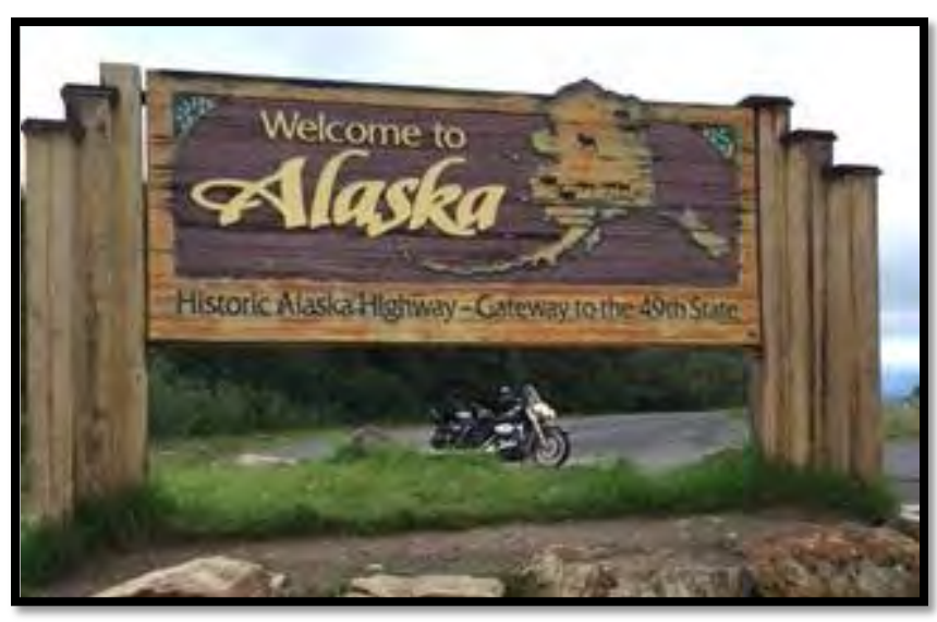
Entering the last frontier.