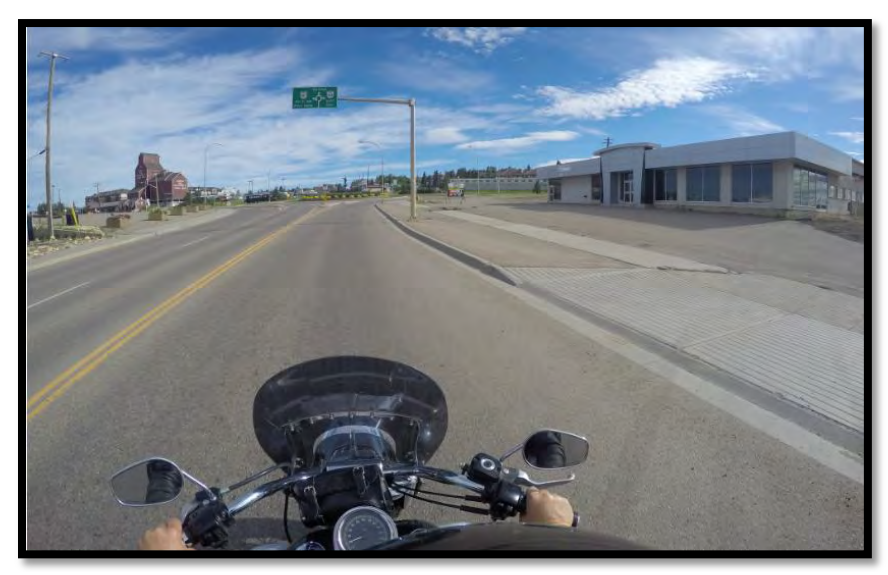
Approaching Mile Post 1 of the world famous Alaska Highway, which begins in Dawson Creek, B.C.