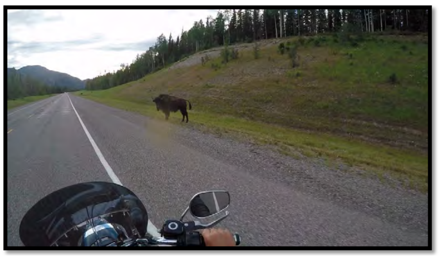
One of the many spectators I saw along the trip.