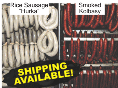
Rice Sausage 'Hurka'