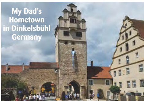
My Dad's Hometown in Dinkelsbühl Germany