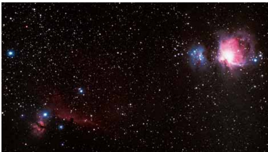
THE FLAME, HORSEHEAD, RUNNING MAN, AND ORION NEBULAE pack an amazing, colorful punch into a relatively small area and repeatedly seduce observers into Orion's sword region. JOHN A. VOLK