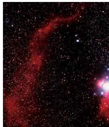
BARNARD'S LOOP , or Sh2-276, wraps around the eastern side of Orion's torso. GERALD RHEMANN

A half degree north of the Orion Nebula, NGC 1975 highlights a complex of reflection nebulae sometimes called the Running Man Nebula. Through a 13-inch scope, NGC 1975 appears as an elongated, bright nebula with a mottled texture. The