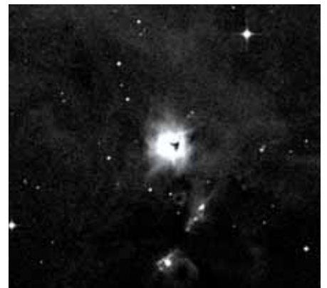
NGC 1999 may look like a ring nebula at first, but closer inspection will reveal a dark, triangular nebula obscuring its center.

To the north and east of Barnard 33, you’ll find M78 (NGC 2068) , one of the sky’s brightest reflection nebulae. The two most vivid concentrations in this nebula bracket an 11th-magnitude star. In a 13-inch scope, M78 spans 5', showing an abrupt northwestern edge and an ill-defined southern edge. A dark lane divides M78 from the much fainter mist of NGC 2067 to the northwest. A quarter degree to the