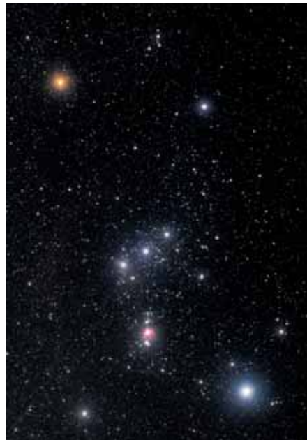
ORION is easily recognized thanks to its bright stars, especially the three in a row that serve as the Hunter's belt.