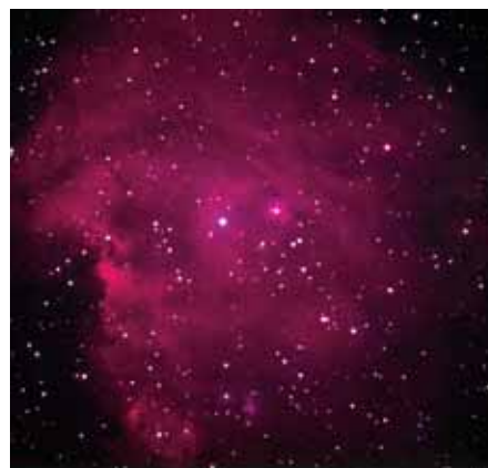
NGC 2174 is a vivid emission nebula near the tip of Orion's club. A 7th-magnitude foreground star lies over its heart.

Pan your scope 3° northeast of Betelgeuse to find Mu ( \mu ) Orionis. With a nebula filter, you should be able to spot the disk of planetary nebula Abell 12 , which appears to touch the bright star. The filter suppresses the star's glare and