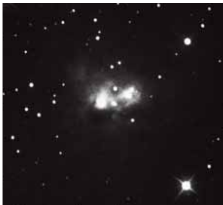
NGC 1788 is a double-lobed reflection nebula near Orion’s border with Eridanus. A dark nebula lurks to the south. PRESTON SCOTT JUSTIS