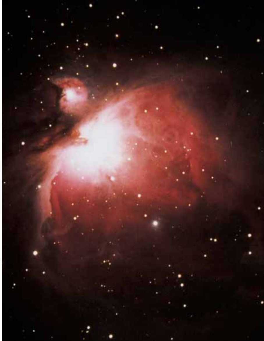
THE ORION NEBULA glows brilliantly as the middle “star” in Orion’s sword. Also known as M42, the famous nebula seems to be connected to the smaller M43 to the north.

Although M43 (NGC 1982) has its own designation, it’s difficult to consider it a distinct object from the Orion Nebula. A circular halo about 4' in diameter, M43 appears just north of the “fish mouth” feature of M42. Look for a sharp truncation, caused by a dark nebula, along the eastern edge of the round haze. Telescopes show the bright variable star NU Orionis at the center of M43. Shining at a relatively constant 7th magnitude, this star varies by only 0.1 magnitude.