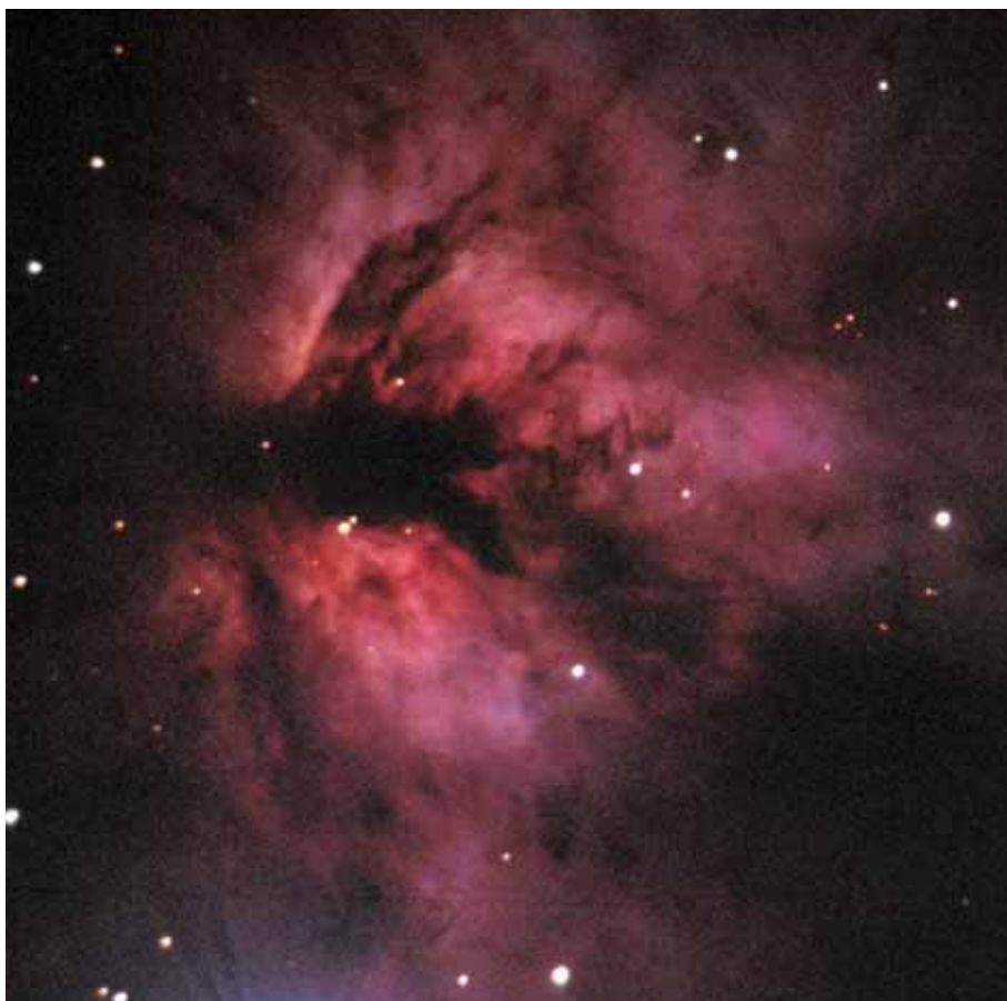
THE FLAME NEBULA (NGC 2024) has branches of nebulosity that lick the sky just as campfire flames reach into a cold night. Zeta Orionis lies beyond the bottom edge of the frame. A. TREMBLY, JR.