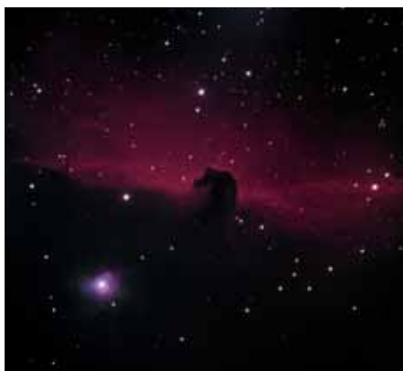
THE HORSEHEAD NEBULA , or Barnard 33, is perhaps the most distinctive dark nebula and a favorite of astrophotographers. JACK NEWTON