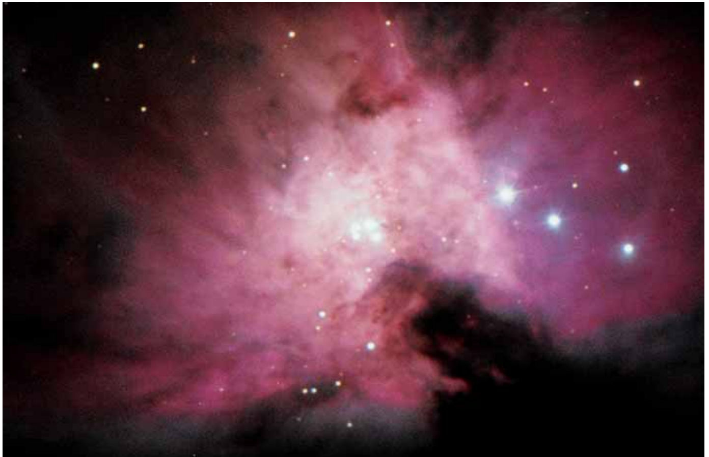
THE TRAPEZIUM REGION at the center of the Orion Nebula (M42) holds a stellar cluster dominated by four bright, young stars born within the nebula. A dark bar (forming the bottom “lip” of the “fish mouth”) protrudes into the bright nebula and points out the Trapezium stars. TONY HALLAS