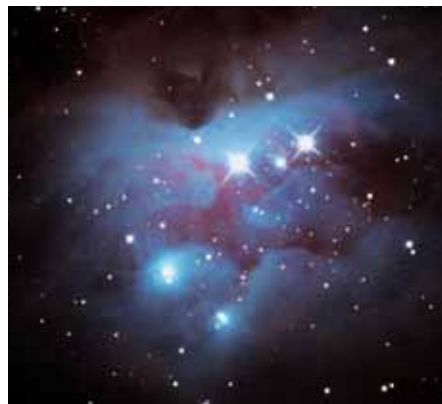
NGC 1975 forms an interesting complex of reflection nebulae with NGCs 1973 and 1977. Some call the group the Running Man Nebula. ANDREW PETERS