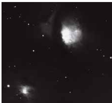
M78 (upper right) overwhelms the dimmer mist of NGC 2067 while NGC 2071 holds its own a bit farther away (lower left).

diameter. The cluster is loose and scattered but has a strong background glow hinting at the presence of dozens of unresolved stars. NGC 2112 lies 2,800 light-years away from us and 600 light-years above the galaxy's plane.