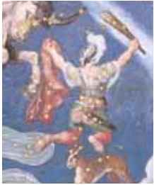
THE GLORIOUS CONSTELLATIONS © 1991; HENRY N. ABRAMS, INC.