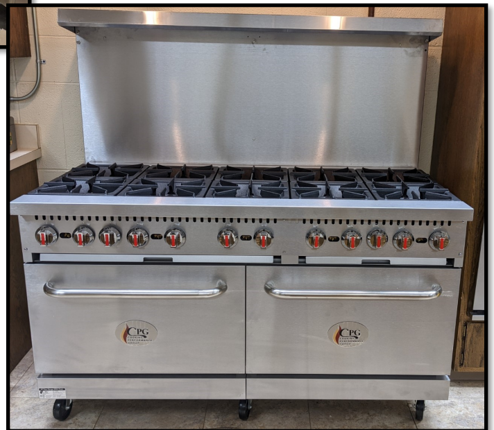
All done and ready to use. Looks great!!