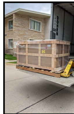
Delivery in a semi