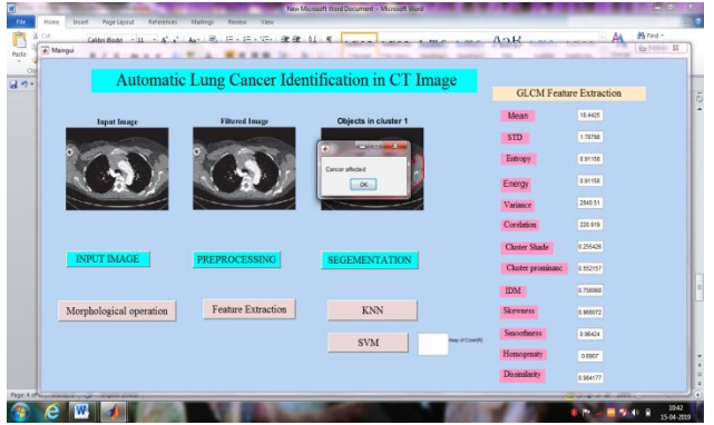
Fig.9: SVM Classifiers

Identifies whether the lung cancer is affected by cancer or not.