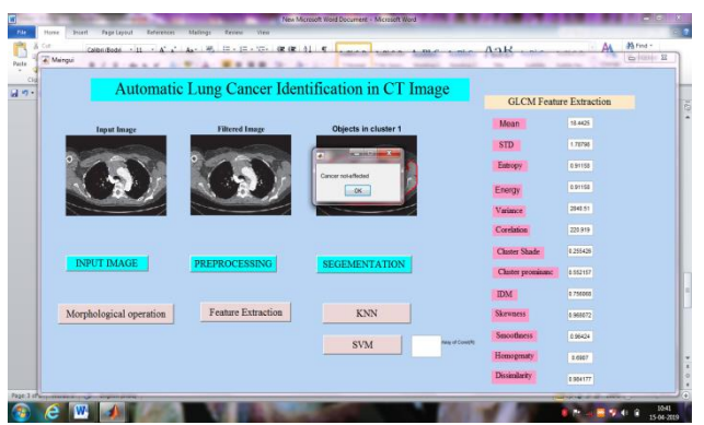
Fig.8: KNN Classifiers