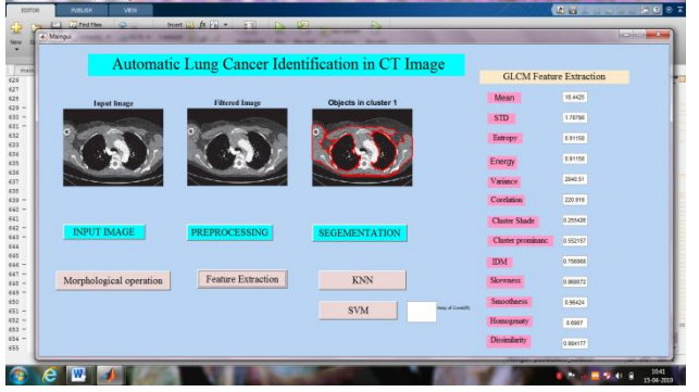
Fig.7: Feature Extraction