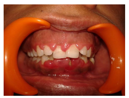
Fig 1: Patient with massive gingival enlargement irt mandibular anteriors