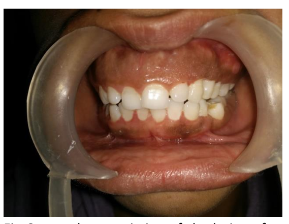
Fig 6: complete remission of the lesion after 6 weeks follow up.