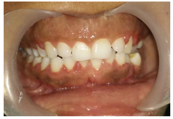
Fig 5: Healing observed after seven days of gingivectomy procedure along with antibiotic coverage. .