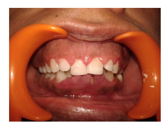
Fig 2: Mild resolution of inflammation after scaling and root planing.