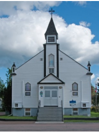
Our Lady of Mercy 11 St. Andrews Street Pointe-du-Chêne, NB