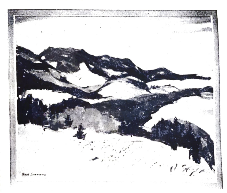
The beautiful Huberdeau mountains with the late afternoon sun casting shadows over the peaceful valley. Painted by Ron Simpkins.